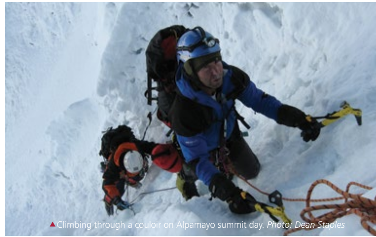
▲ Climbing through a couloir on Alpamayo summit day.

We leave camp early and climb on sometimes steep snow slopes for about an hour to a bergschrund at the bottom of the Southwest Face. At times there are