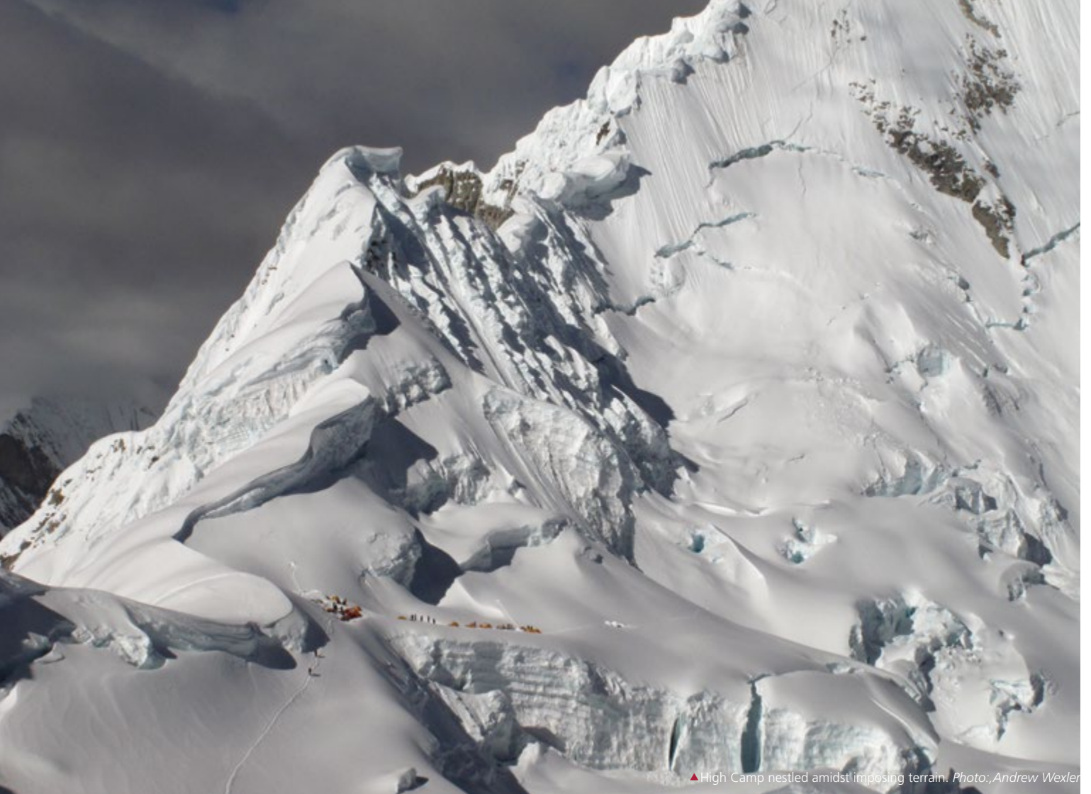
▲ High Camp nestled amidst imposing terrain.

3 People add on US$3,900 per person 4 People add on US$3,200 per person