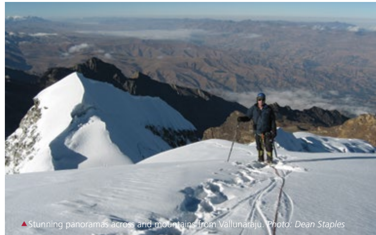
▲ Stunning panoramas across arid mountains from Vallunaraju.