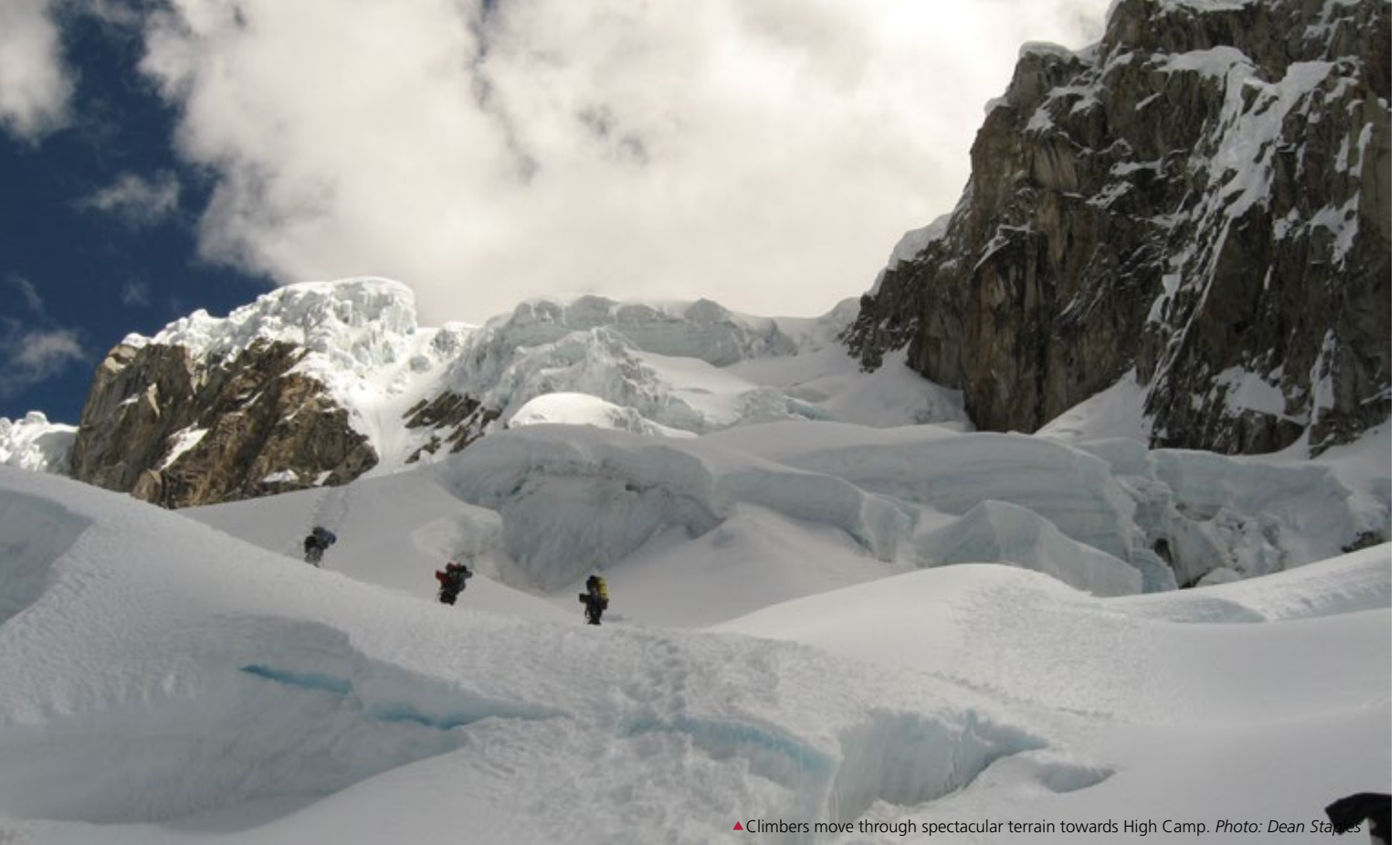
▲ Climbers move through spectacular terrain towards High Camp.

We then drive north to the Santa Cruz Valley, where we begin our trek into Base Camp. With the bulk of our gear on pack animals, we gradually acclimatise as we ascend the valley beneath some of the famous peaks of the Cordillera Blanca—Artesonraju, the enormous Santa Cruz and the very imposing pyramid of Quitaraju.