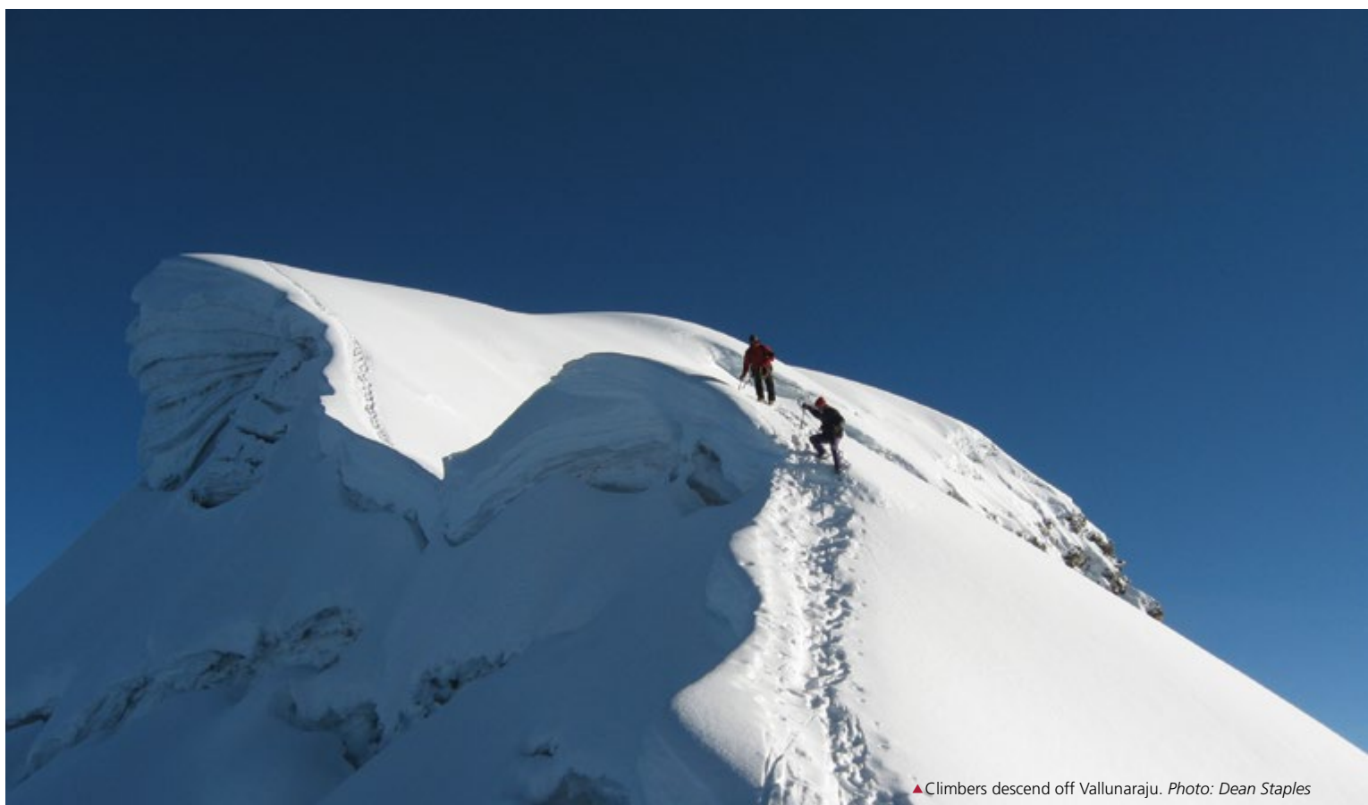
▲ Climbers descend off Vallunaraju.

Generally, entry visas are not required for travellers staying less than three months in Peru, but please check with your travel agent.