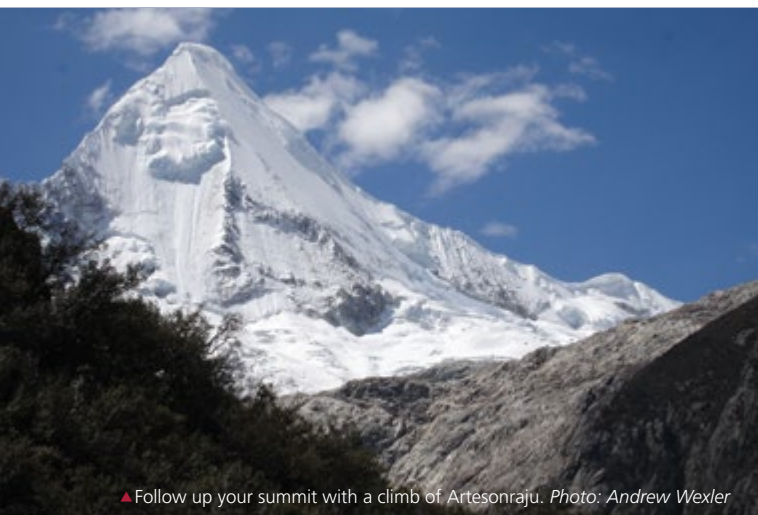
▲ Follow up your summit with a climb of Artesonraju.