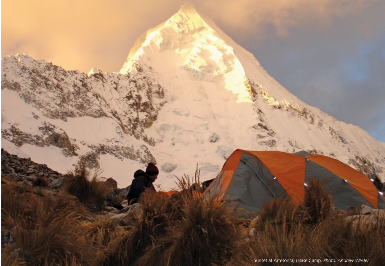
▲ Sunset at Artesonraju Base Camp.

We also require members to obtain rescue insurance and we will consult with individual team members regarding your insurance needs and solutions for coverage.