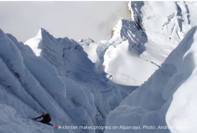
▲ A climber makes progress on Alpamayo.