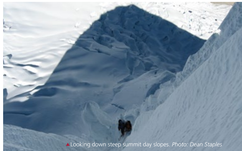
▲ Looking down steep summit day slopes.