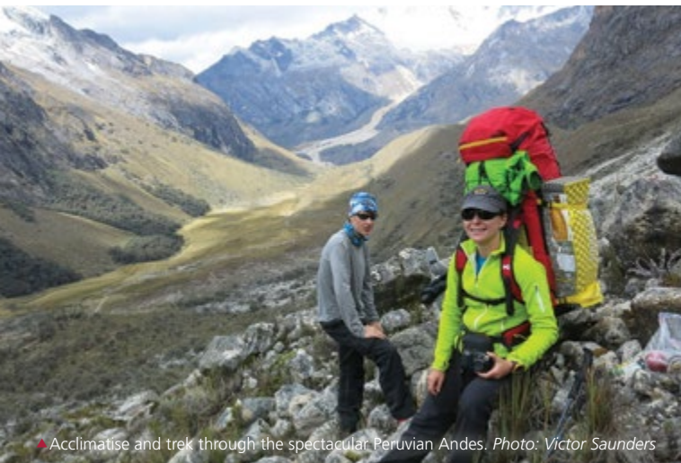
▲ Acclimatise and trek through the spectacular Peruvian Andes.

We initially walk up quite steeply for around 1 hour on a grassy hillside before reaching a wide open grassy ridge which we follow easily to a saddle at 4,200m/13,780ft. From the ridge, there are fantastic views over Huaraz across to the snow-capped peaks of the Cordillera Blanca, Peru's highest mountain, Huascarán, and the Cordillera Negra. The walk then descends a long way with open views all the way to finish in Huaraz around 5 hours later.