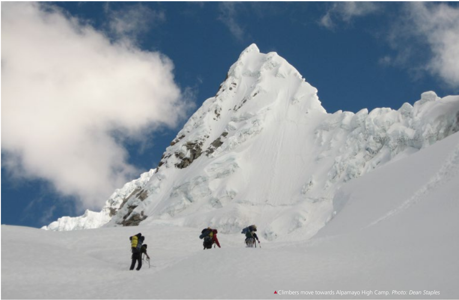
▲ Climbers move towards Alpamayo High Camp.