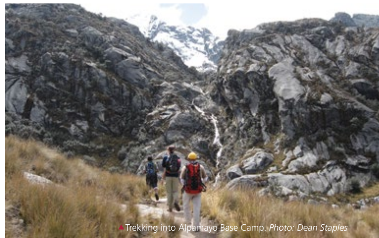
▲ Trekking into Alpamayo Base Camp.