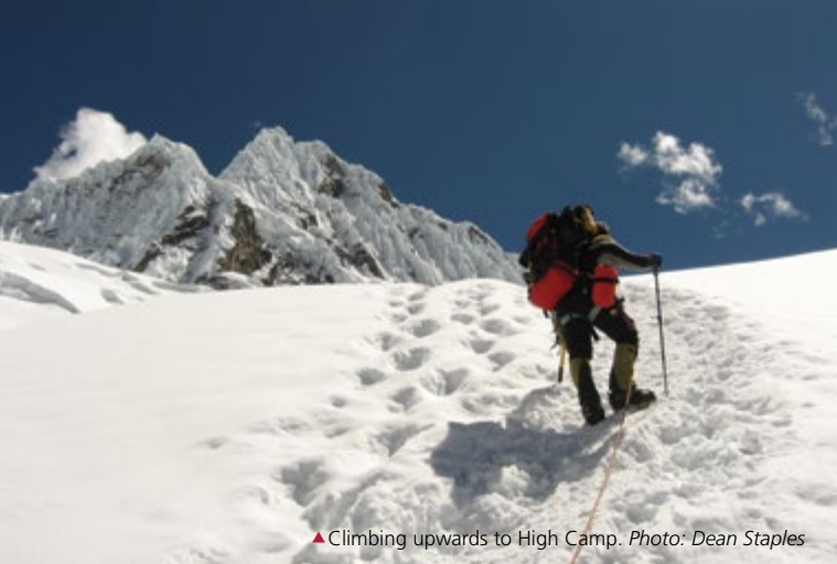
▲ Climbing upwards to High Camp.