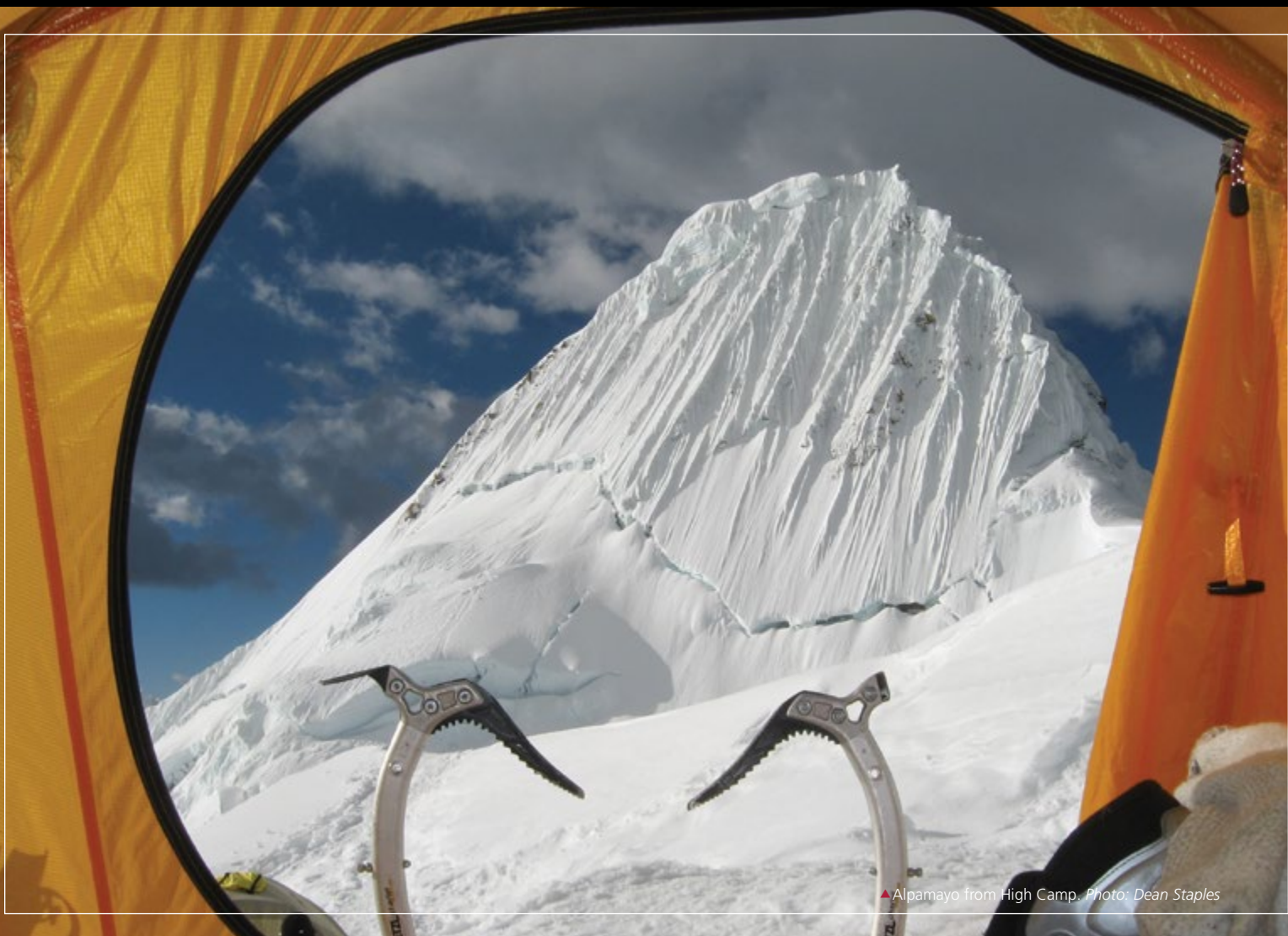
▲ Alpamayo from High Camp.