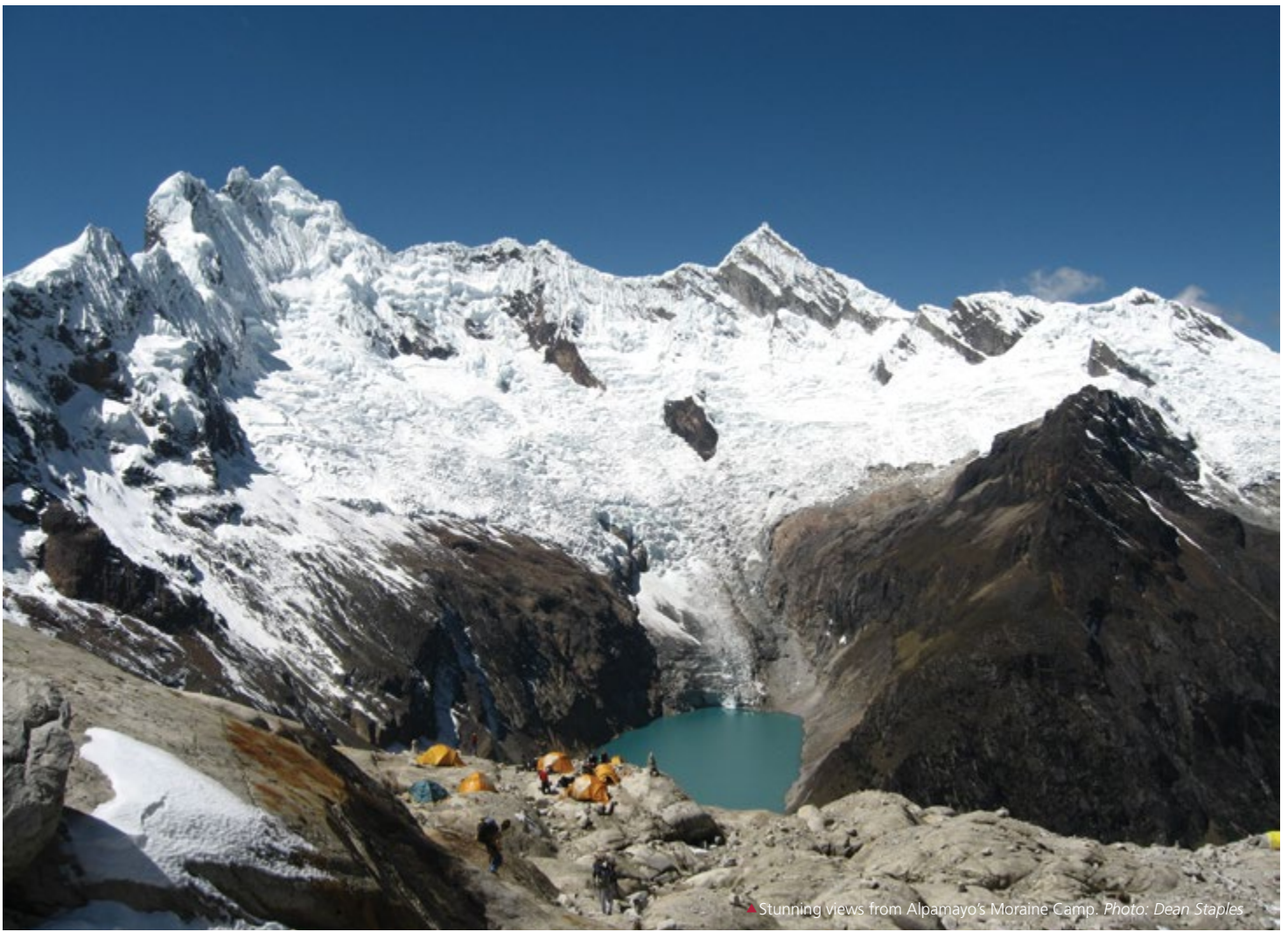
Stunning views from Alpamayo's Moraine Camp.

crevasses to negotiate. The climb on the Southwest Face to the summit is steep and technical, with mixed good snow and hard ice. The climb to the summit takes about 5 hours. The descent is by the same route and takes 9 rappels. We return to sleep at High Camp, with the whole day taking approximately 8–9 hours. With an early start and early arrival back at High Camp, there is the option to descend to Base Camp on the same day also.