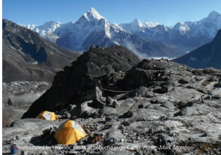
▲ Surrounded by majestic peaks at Lobuche High Camp.