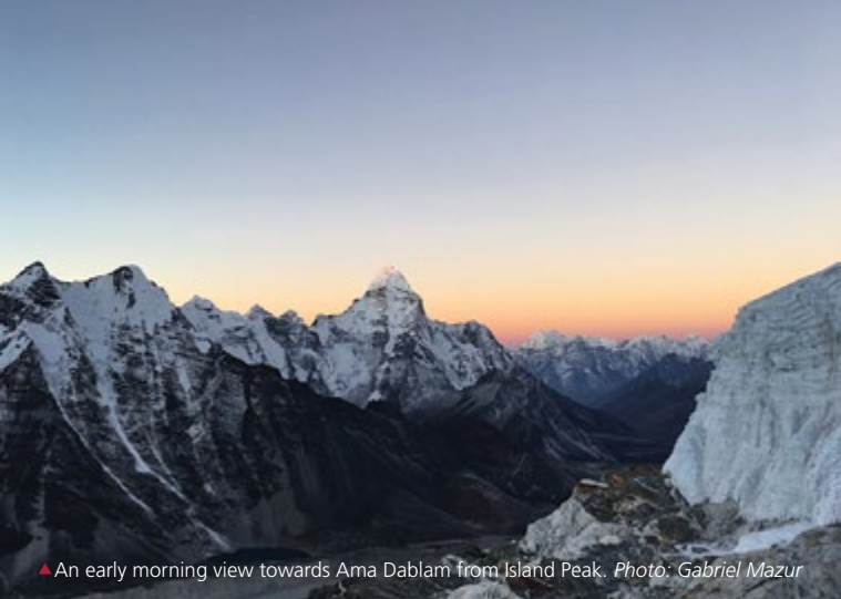
▲ An early morning view towards Ama Dablam from Island Peak.