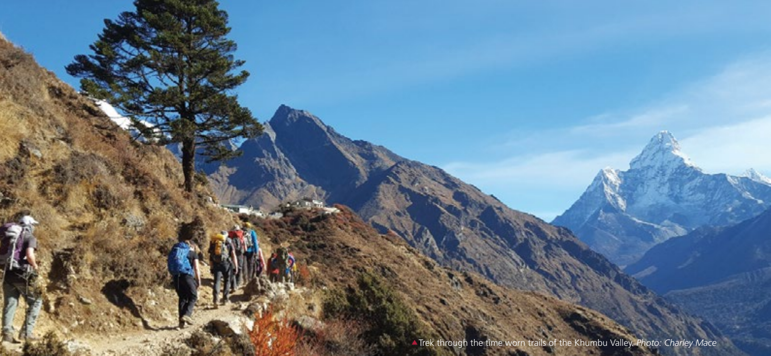
▲ Trek through the time worn trails of the Khumbu Valley.

Island Peak, the highest of the Three Peaks at 6,189m/20,305ft, is referred to by the local Sherpa people as Imja Tse—an ‘Island in a Glacial Sea’. An ideal mountain on which to finish the trilogy, Island Peak crosses more technical terrain than the previous two climbs and involves slightly more exposure, including the use of ladders on the glaciated lower sections of the climb and fixed ropes on the upper snow and ice sloped sections. It is an exciting and popular peak, with views from the summit towards Ama Dablam and the south wall of Nuptse/Lhotse that are awe-inspiring. Each of these are very doable climbs for anyone in good shape and with a desire for high adventure.