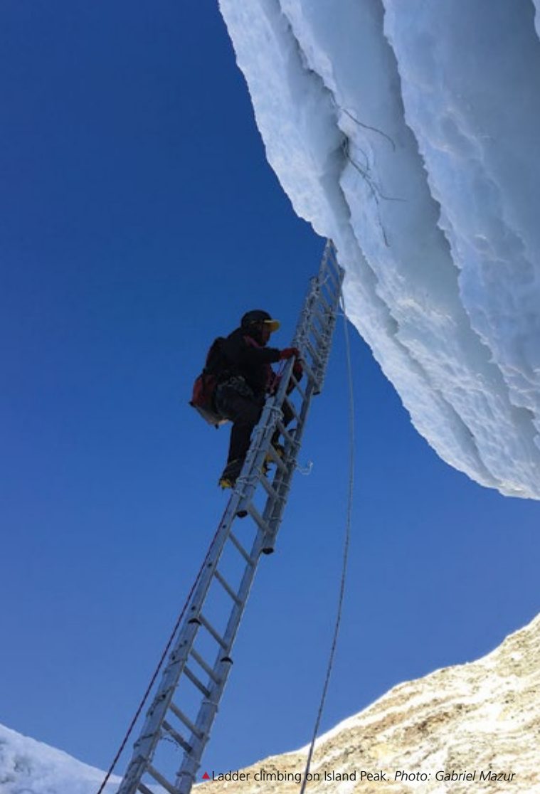
▲ Ladder climbing on Island Peak.