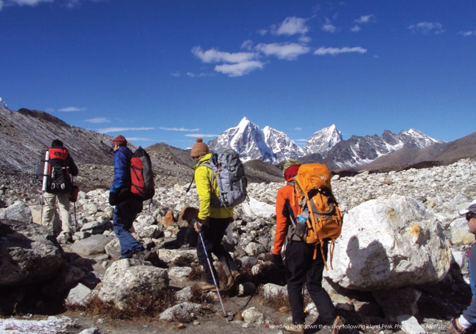
Heading back down the valley following Island Peak