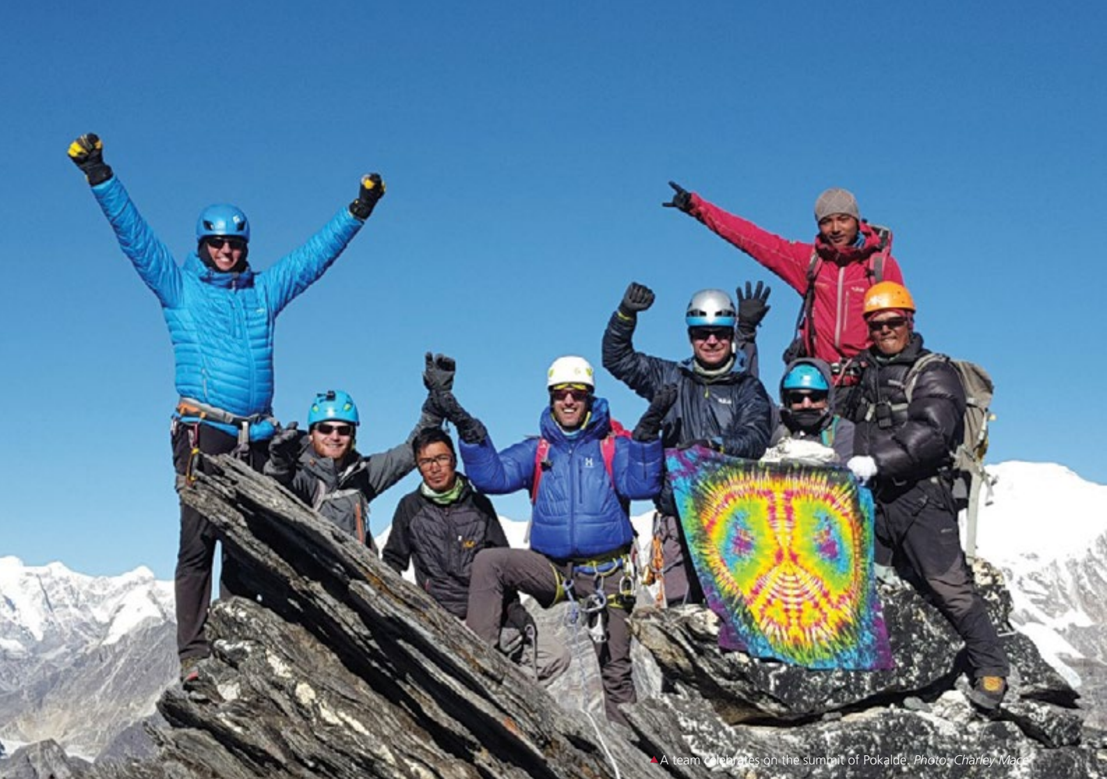
▲ A team celebrates on the summit of Pokalde.