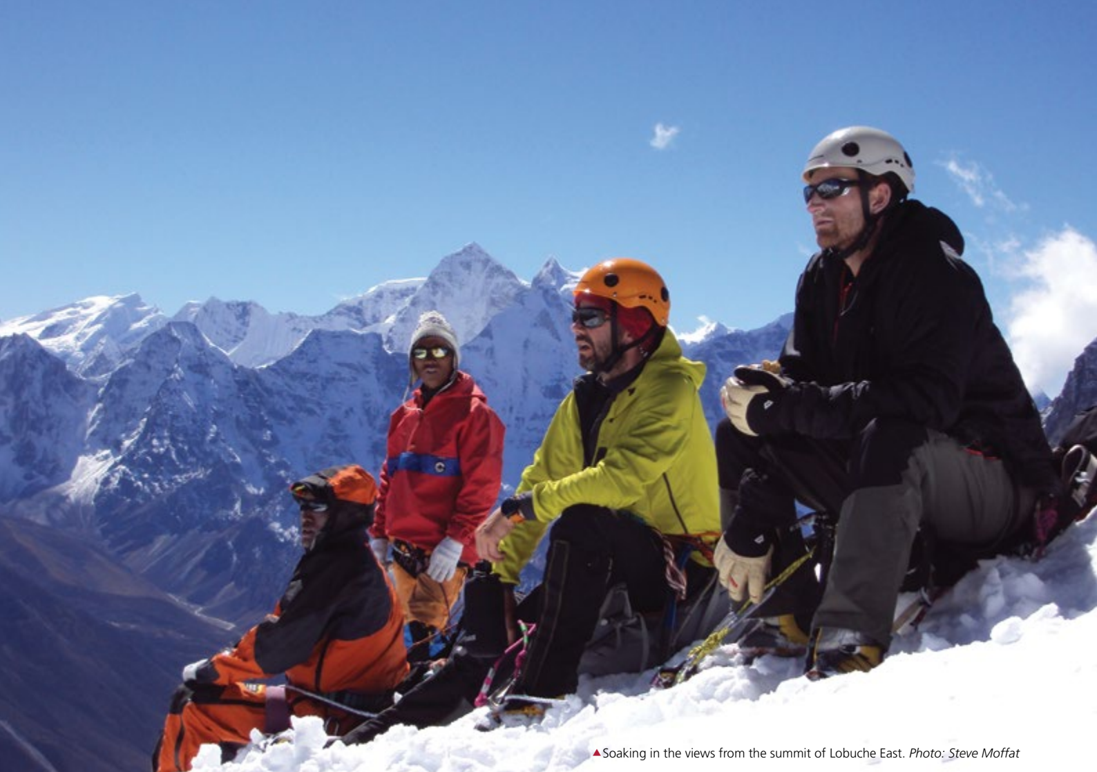
▲ Soaking in the views from the summit of Lobuche East.