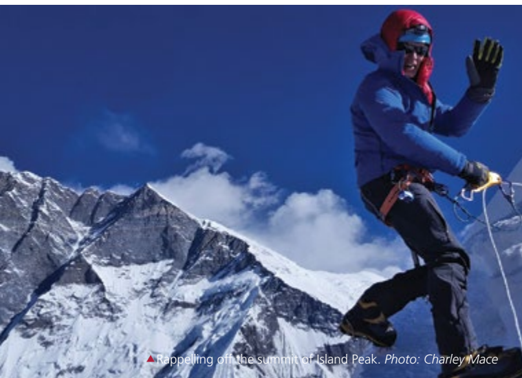
▲ Rappelling off the summit of Island Peak.