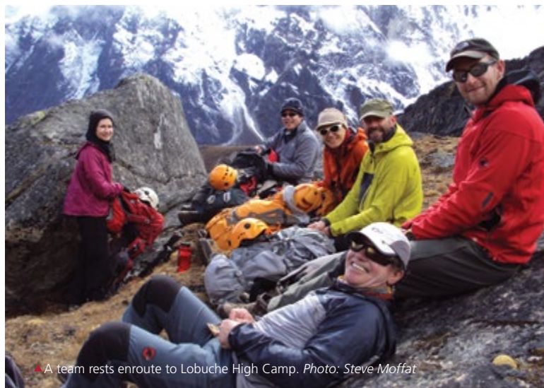
▲ A team rests enroute to Lobuche High Camp.

Many of our expedition members come to us because they have seen us in action on a previous trip and decide to opt for our level of service and proven experience. Others return because they know we do our very best to make expeditions safe and successful.