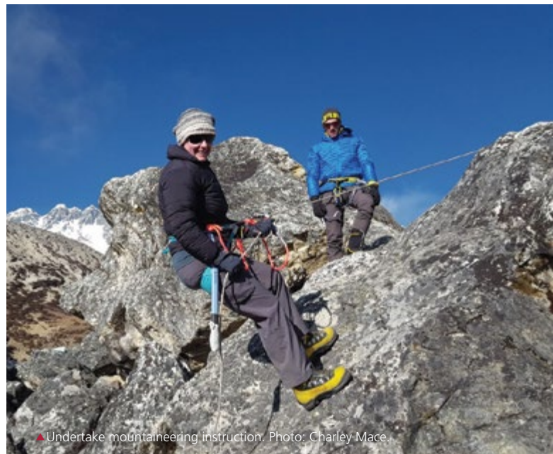
▲ Undertake mountaineering instruction.

Our early start, around 2.30am, sees us climbing the South East Ridge, which is a mixture of snow and ice. Where necessary, we fix ropes along the route and steady climbing will bring us to the far eastern summit. From the top, we are well rewarded with superb views across to Ama Dablam, Makalu, Lhotse, Everest, Nuptse, Changtse, Pumori, Gyachung Kang and Cho Oyu. Then it's time for our descent, all the way back to our Base Camp to celebrate our first ascent!