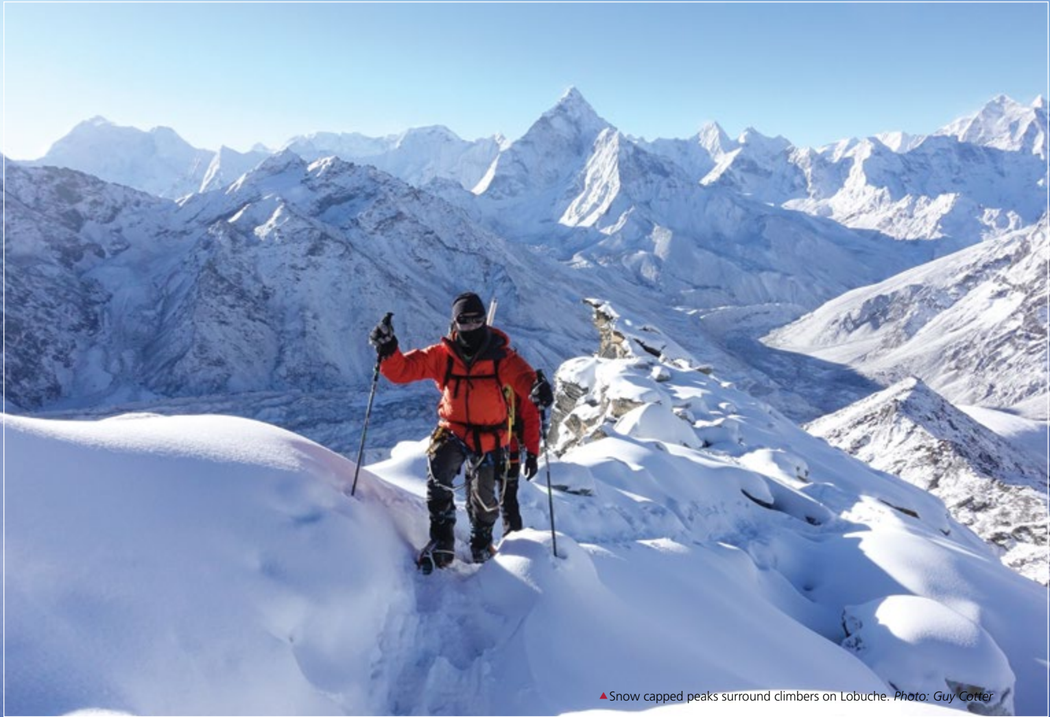
▲ Snow capped peaks surround climbers on Lobuche.