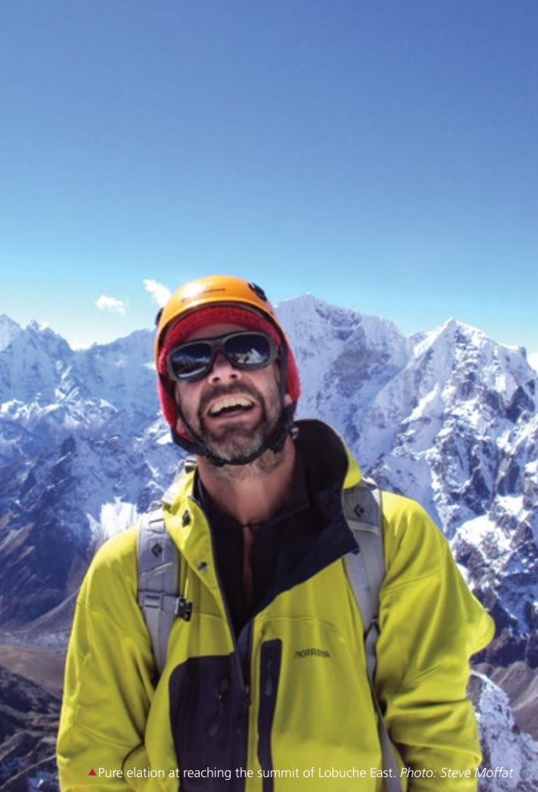
▲ Pure elation at reaching the summit of Lobuche East.