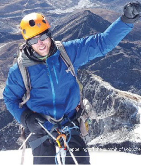
▲ Rappelling off the summit of Lobuche.

During the post monsoon season of 2024, Adventure Consultants will operate an expedition to climb three of Nepal's most popular trekking peaks; Lobuche East (6,119m/20,075ft), Pokalde (5,806m/19,049ft) and Island Peak (6,189m/20,305ft). The Three Peaks Nepal expedition visits Everest Base Camp, crosses the high Kongma La Pass between peaks and completes a fabulous circuit of the upper Khumbu tributaries, before returning to Namche Bazaar and back to Lukla.