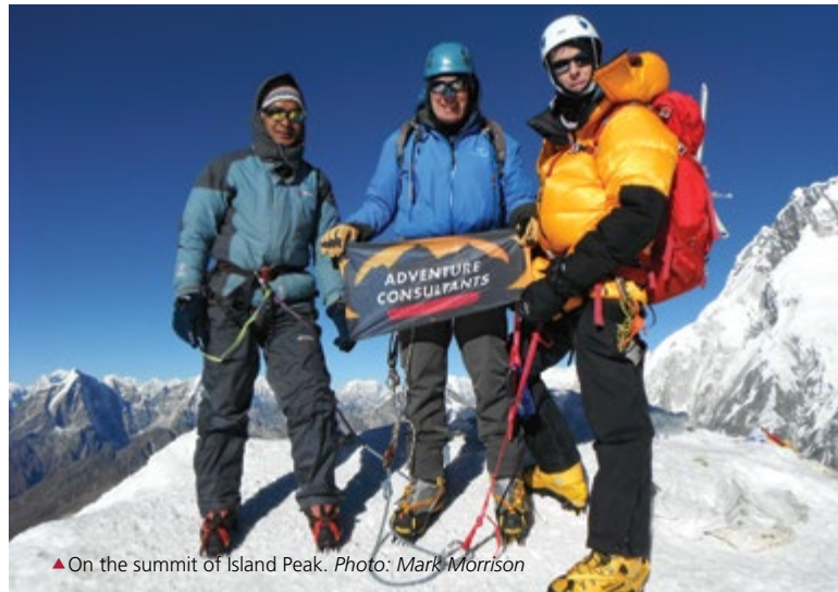
▲ On the summit of Island Peak.

After the ascent of Lobuche East, we spend a day resting and preparing for our trek across the spectacular Kongma La to Pokalde High Camp, located near the top of the pass. We watch the sun dip below the horizon and feel the allure of a down jacket and warm sleeping bag! In the morning we will pack up and head off to climb Pokalde just on sunrise.