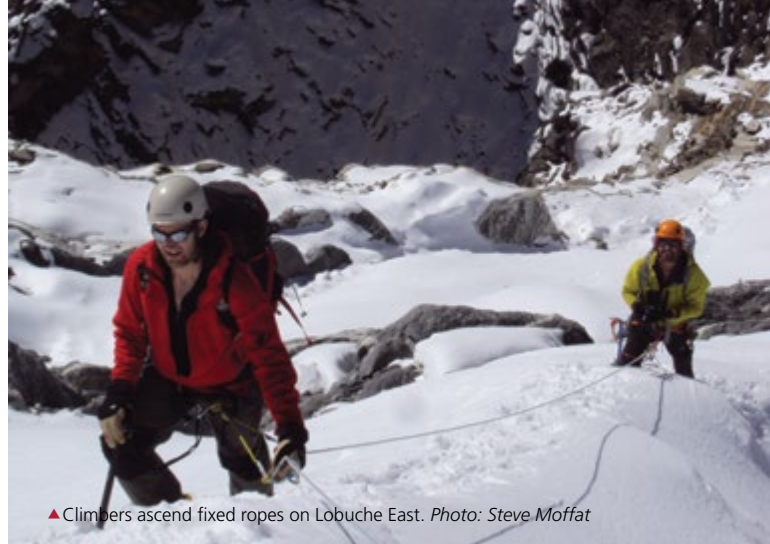
▲ Climbers ascend fixed ropes on Lobuche East.