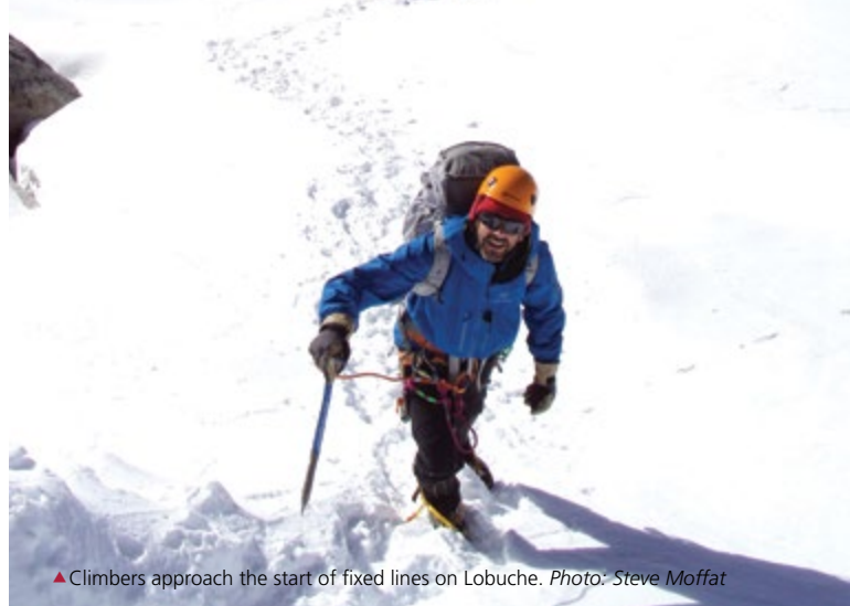
▲ Climbers approach the start of fixed lines on Lobuche.