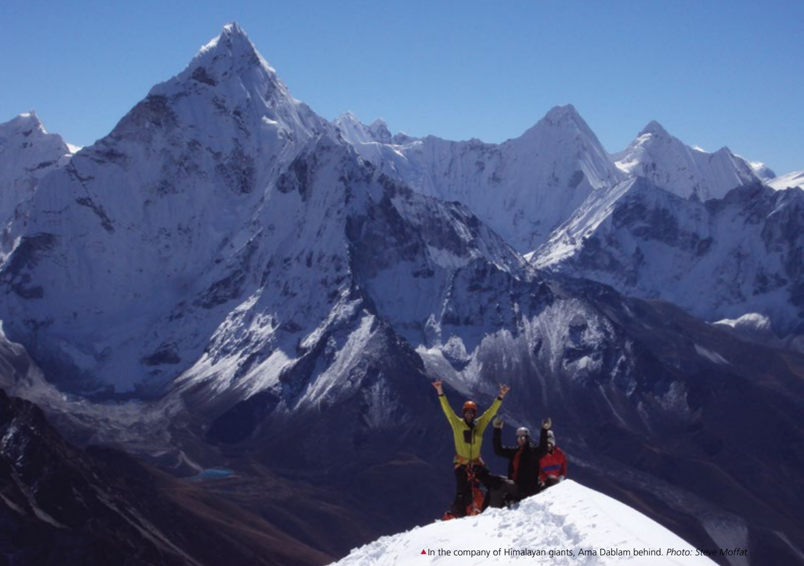
▲ In the company of Himalayan giants, Ama Dablam behind.