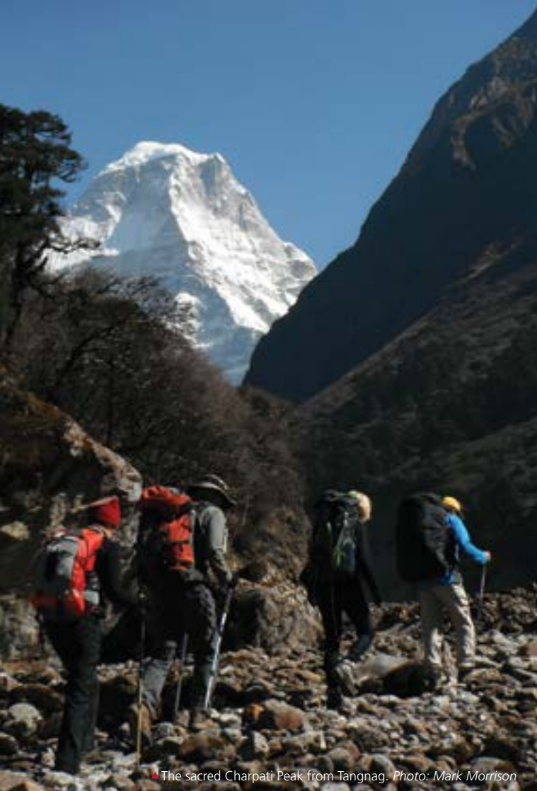
▲ The sacred Charpatil Peak from Tangnag.