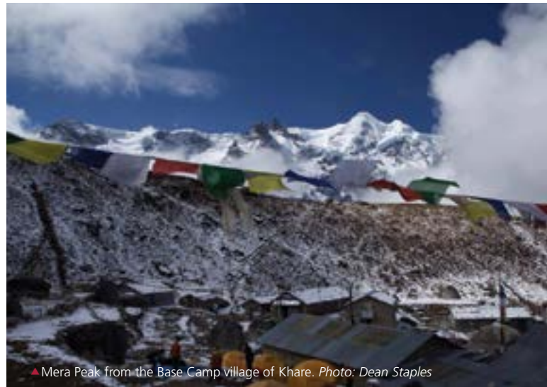
▲ Mera Peak from the Base Camp village of Khare.