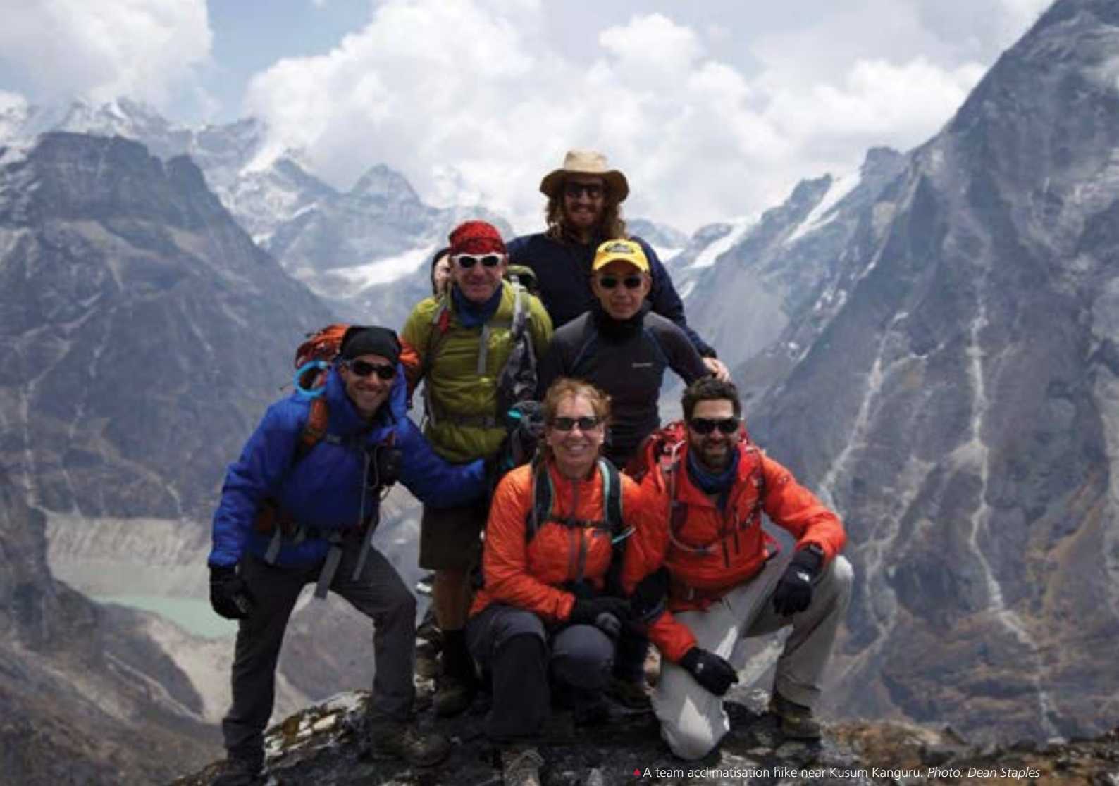
▲ A team acclimatisation hike near Kusum Kanguru.

a comprehensive briefing for the trip. This also provides an opportunity to check personal equipment. There are plentiful stores with trekking equipment available for purchase or hire so anything forgotten is soon replaced.