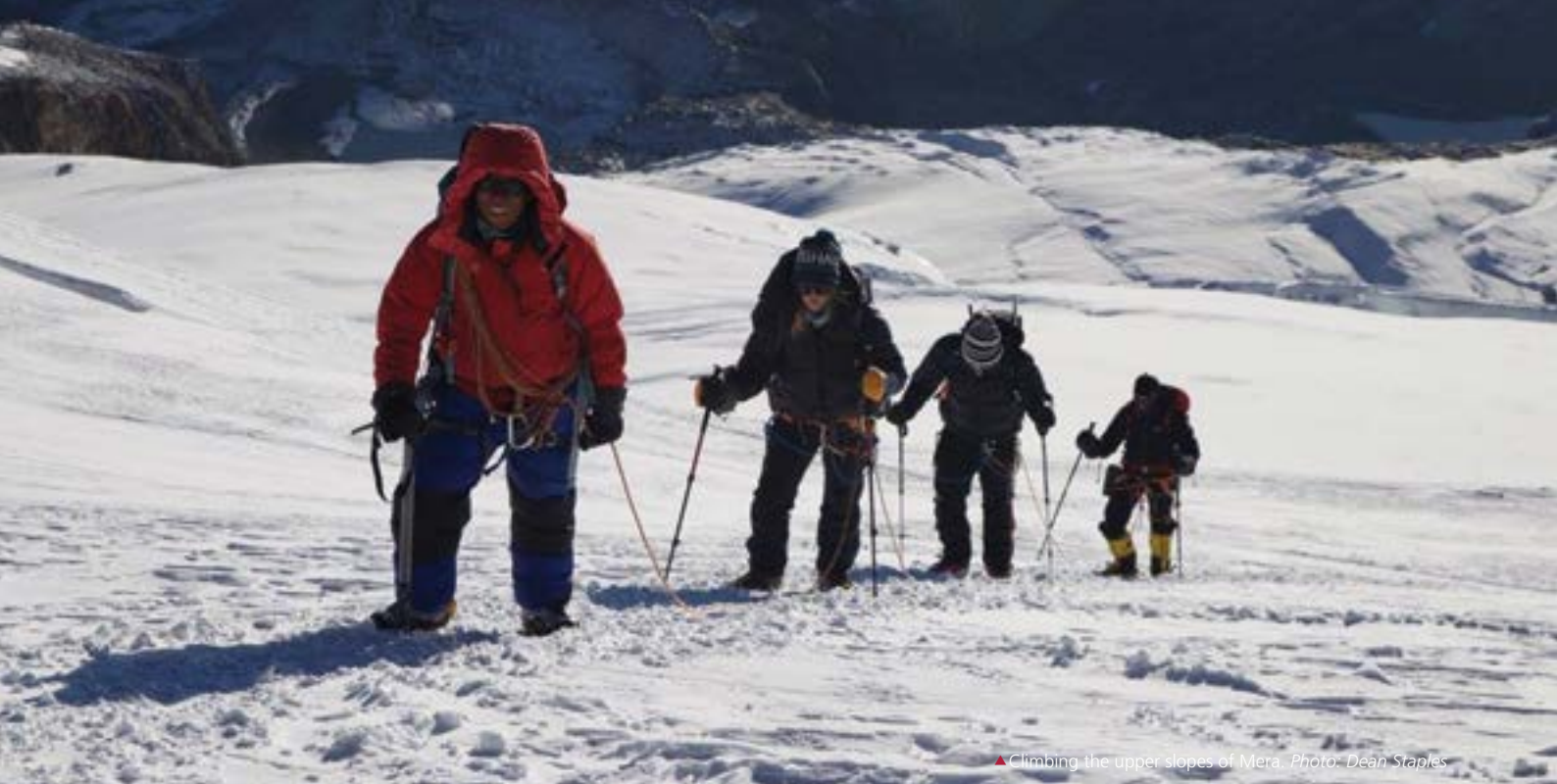
▲ Climbing the upper slopes of Mera.