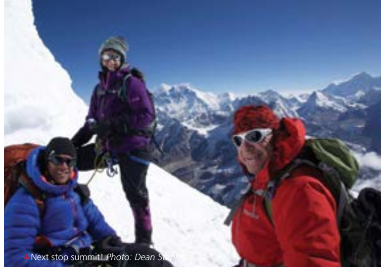
▲ Next stop summit!