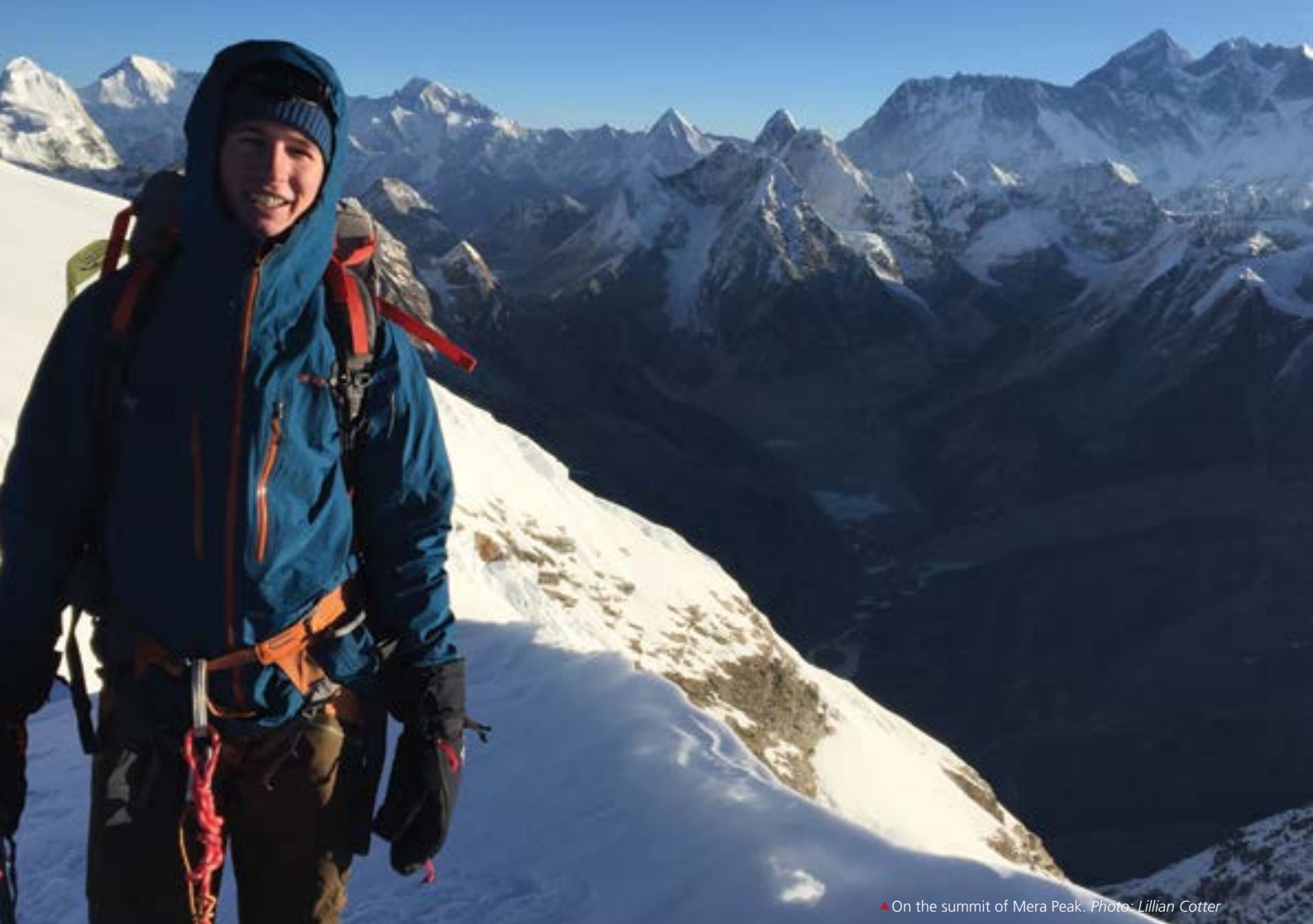
▲ On the summit of Mera Peak.