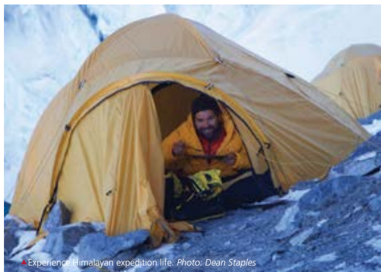
▲ Experience Himalayan expedition life.

We then move up to our High Camp under a rocky outcrop at 5,800m/19,030ft. Making the final approach to the summit reveals an amazing panorama of the highest mountains on earth, with Makalu and Everest looming over peaks like Baruntse, Chamlang and Nau Lekh. We aim to make the summit early to mid-morning and return to Base Camp that afternoon or evening.