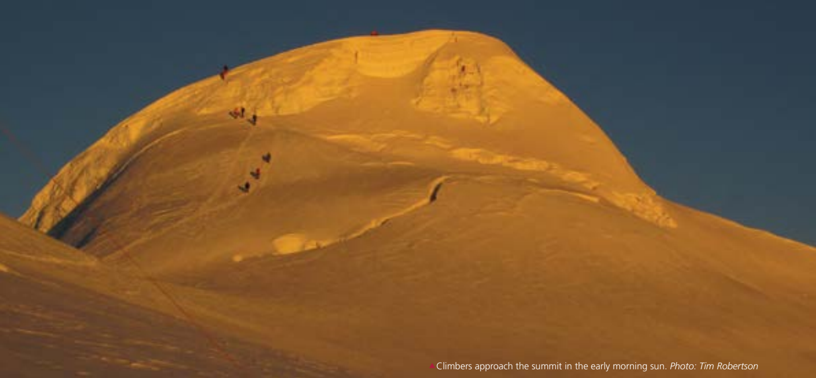
• Climbers approach the summit in the early morning sun.