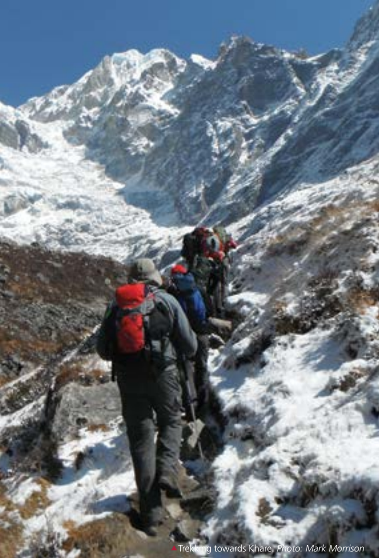
▲ Trekking towards Khare.