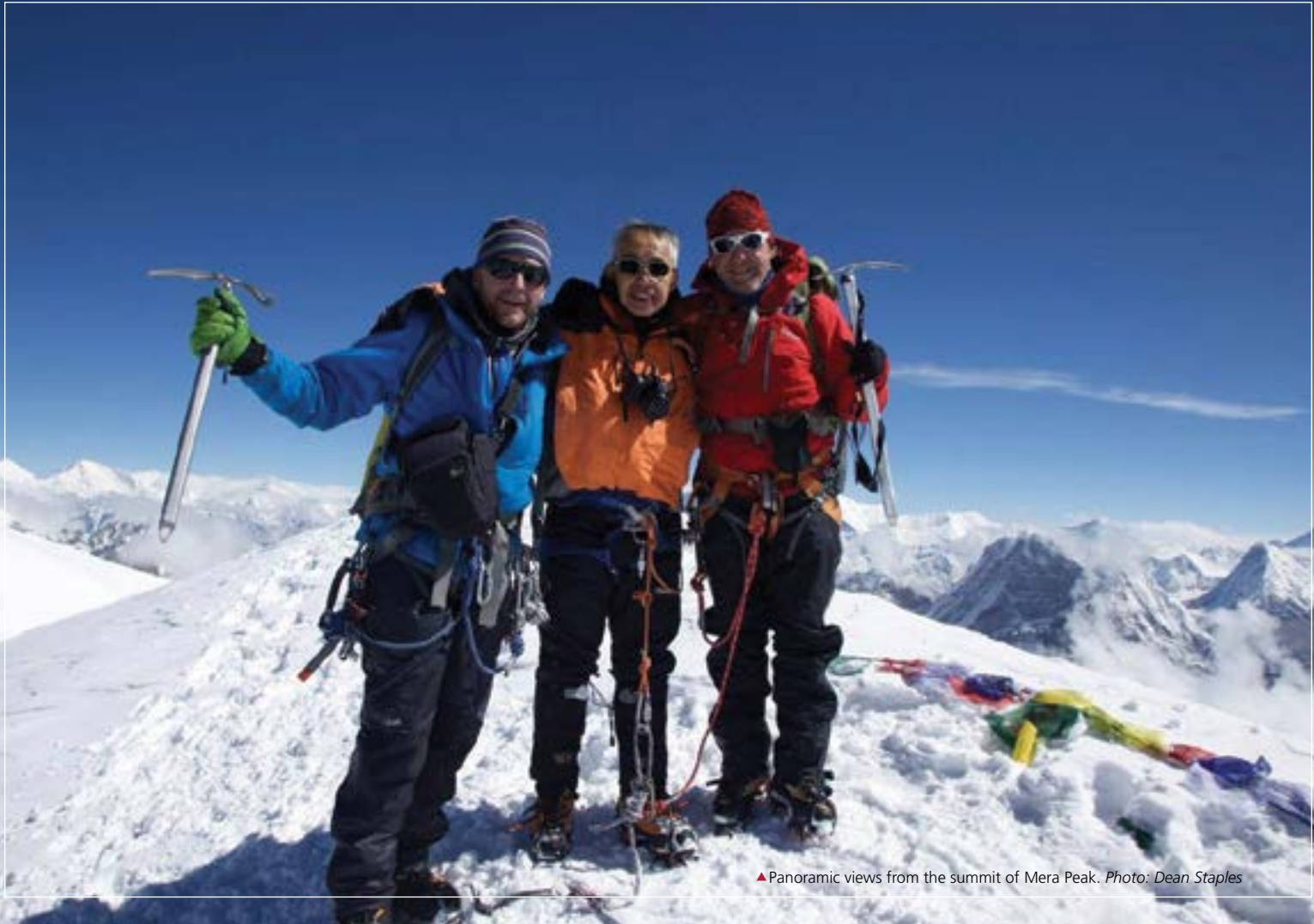
▲ Panoramic views from the summit of Mera Peak.