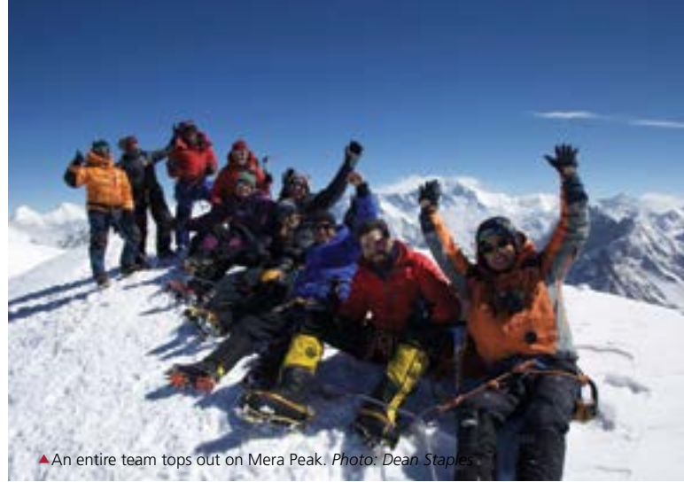
▲ An entire team tops out on Mera Peak.