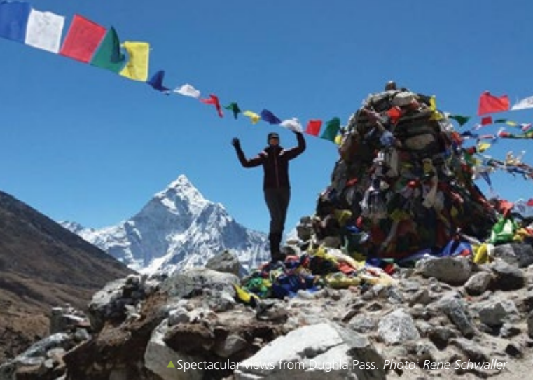
▲ Spectacular views from Dughia Pass.