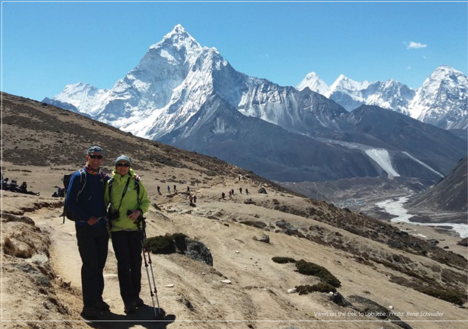
Views on the trek to Lobuche.