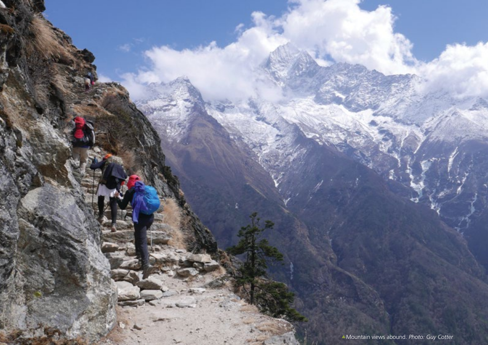
▲ Mountain views abound.

NOTE: All bank transfer charges are for the remitter's account.