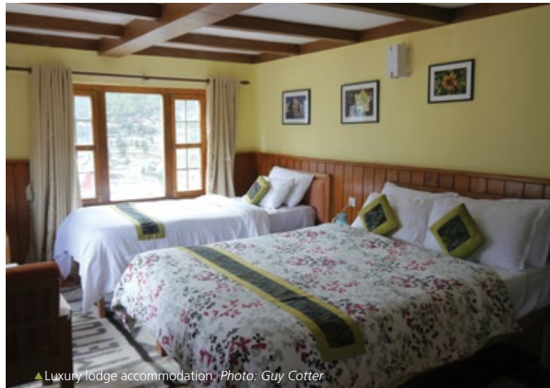
▲ Luxury lodge accommodation.