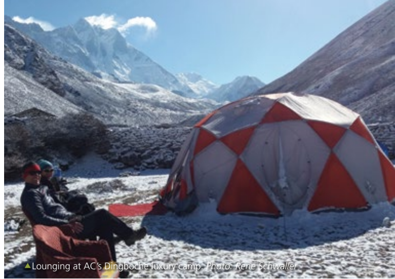
▲ Lounging at AC's Dingboche luxury camp.