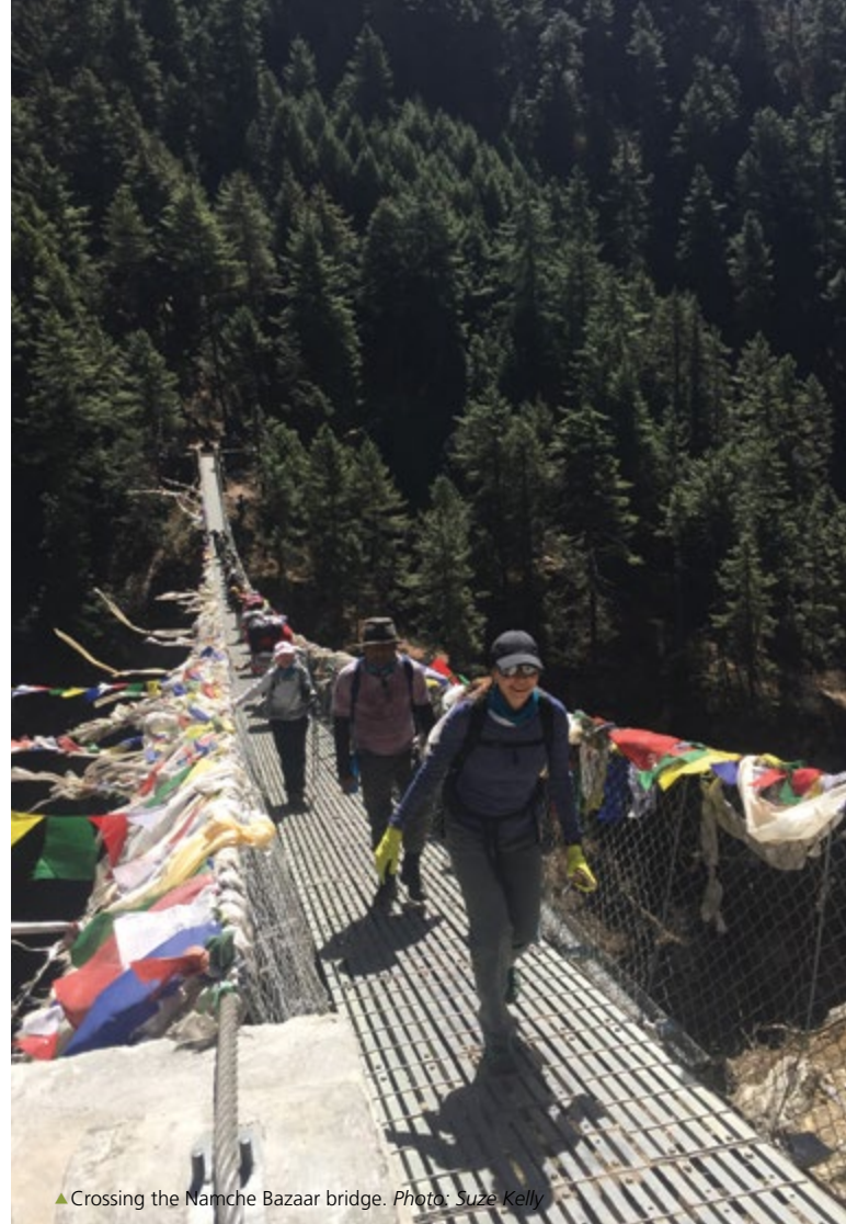
▲ Crossing the Namche Bazaar bridge.