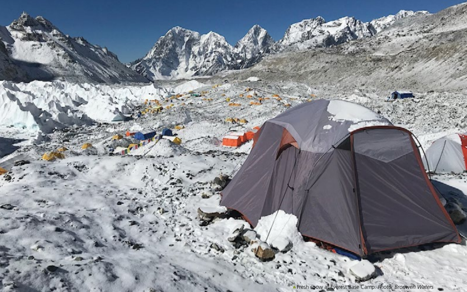
▲ Fresh snow at Everest Base Camp.