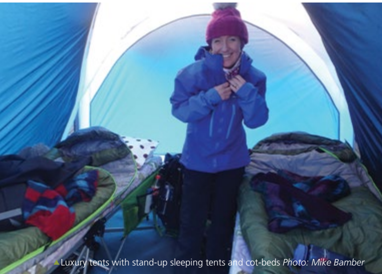
▲ Luxury tents with stand-up sleeping tents and cot-beds