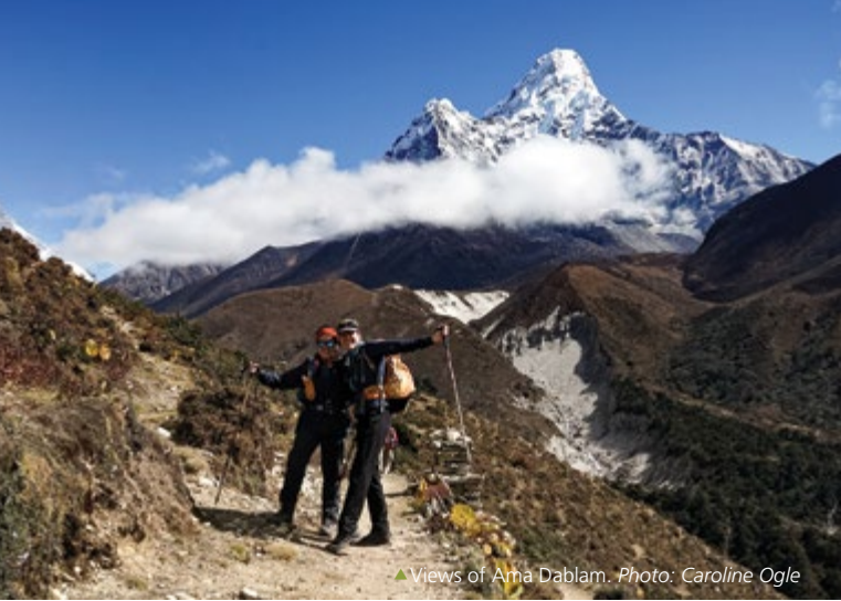
▲ Views of Ama Dablam.