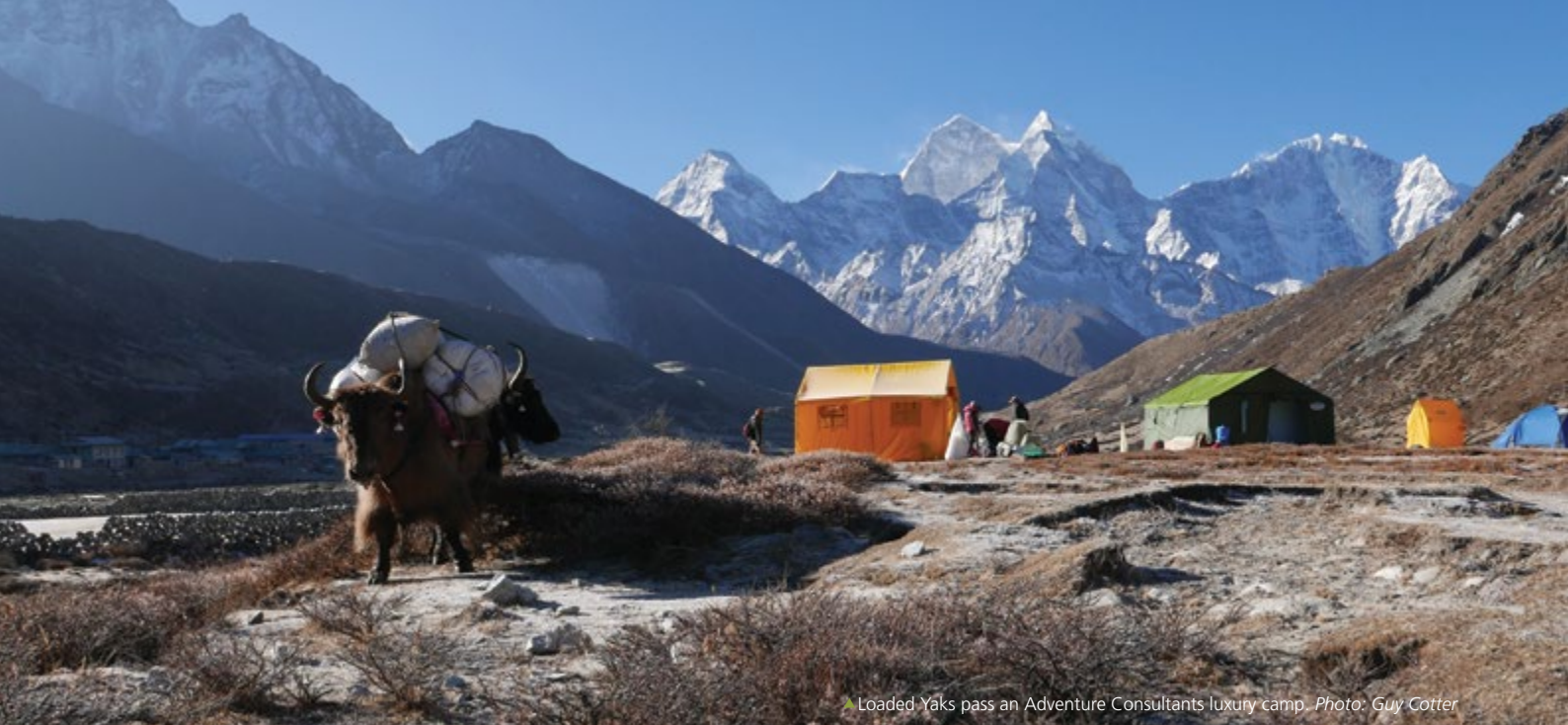
Loaded Yaks pass an Adventure Consultants luxury camp.

views of Everest can be magical, and we hope to enjoy a photographic session with you there! We spend a final night in Gorak Shep before our spectacular scenic helicopter flight back to Kathmandu.