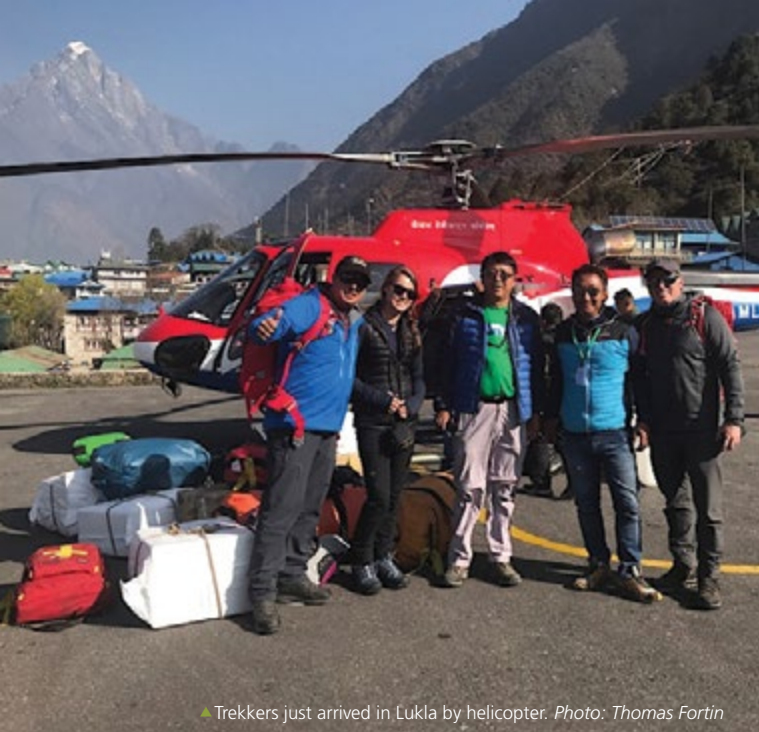
▲ Trekkers just arrived in Lukla by helicopter.