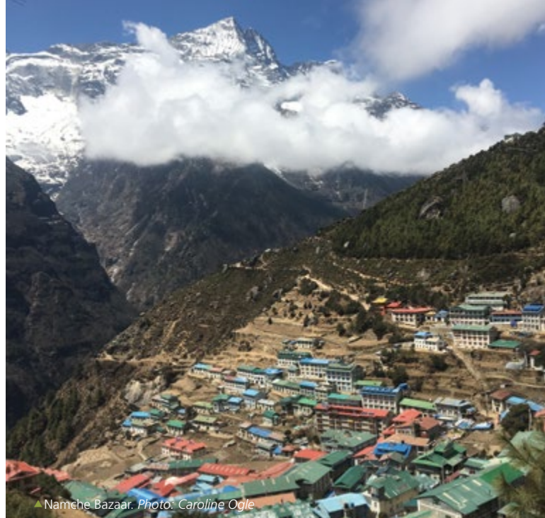
▲ Namche Bazaar.

There is the issue of altitude to contend with which is incorporated into our trekking itinerary. We have included rest days at the relevant elevations to allow our bodies to adjust to the thin air and we carry sufficient medication to deal with most altitude related problems. Experience has shown us that good hydration, rest days at significant elevations and good base fitness help avoid any significant problems during this trek.