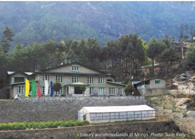
▲ Luxury accommodation at Monjo.