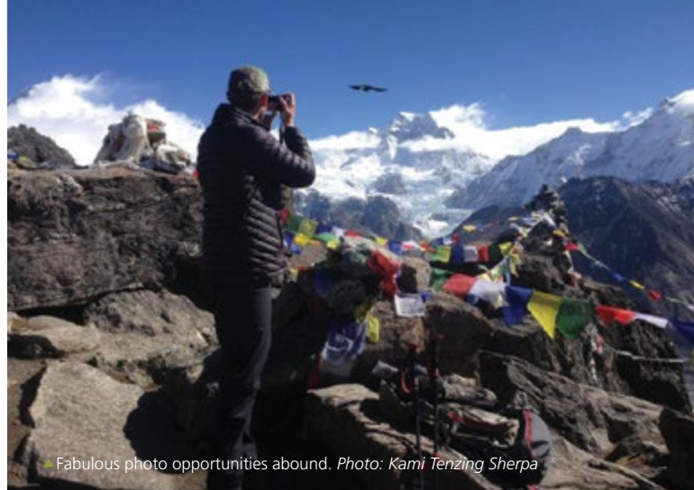
▲ Fabulous photo opportunities abound.