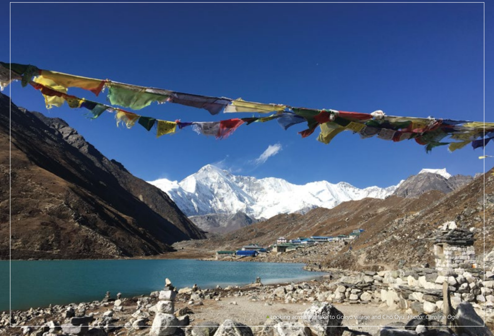
Looking across the lake to Gokyo village and Cho Oyu.