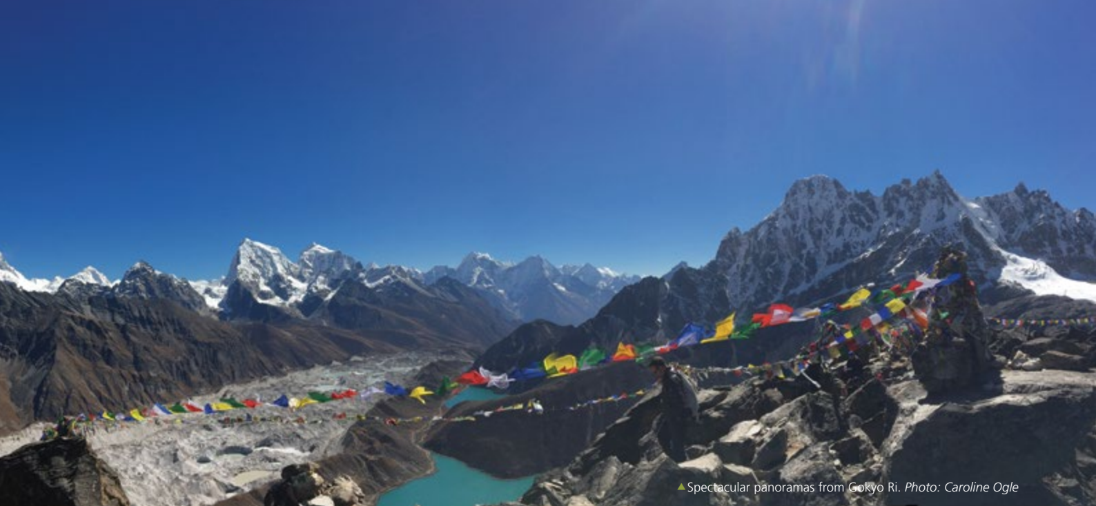
▲ Spectacular panoramas from Gokyo Ri.