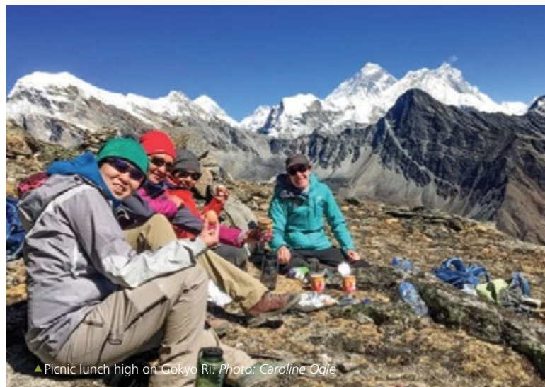
▲ Picnic lunch high on Gokyo Ri.