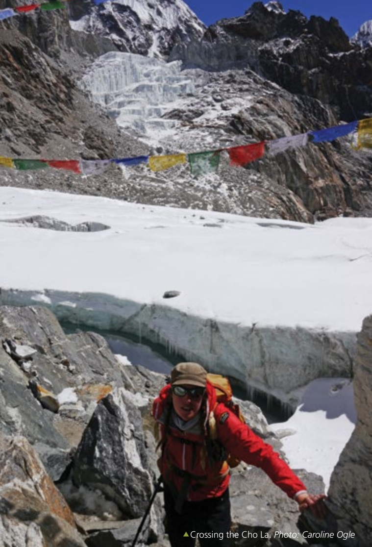
▲ Crossing the Cho La.