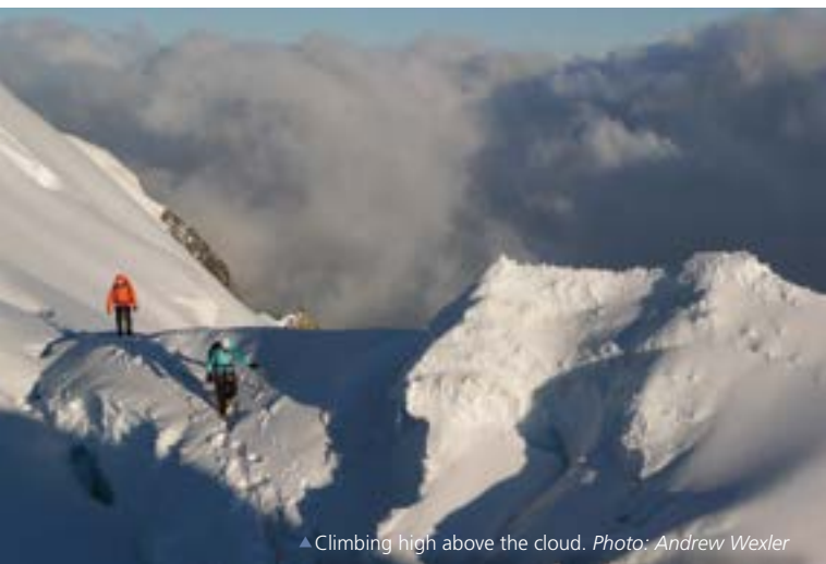
▲ Climbing high above the cloud.

Climbing in the European Alps requires high-quality clothing and equipment due to the extremes of weather conditions. Our focus is on having the essential clothing and equipment to keep you warm and comfortable during the climb.