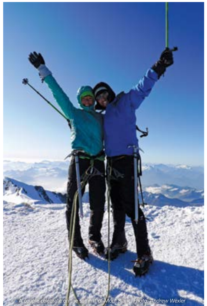
▲ A couple celebrate on the summit of Mont Blanc.