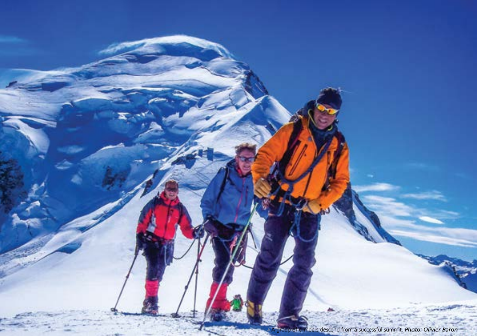
A group of climbers descend from a successful summit.