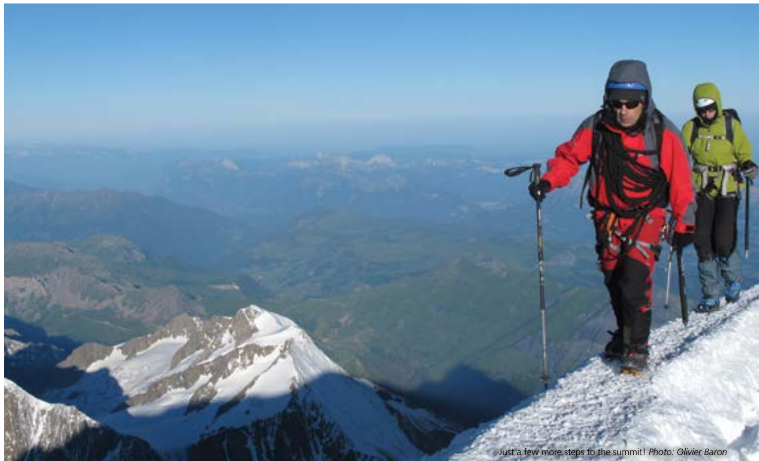
Just a few more steps to the summit!

We can also accept your deposit and balance payment by credit card (Visa, Mastercard and Amex), plus a 3% card fee.