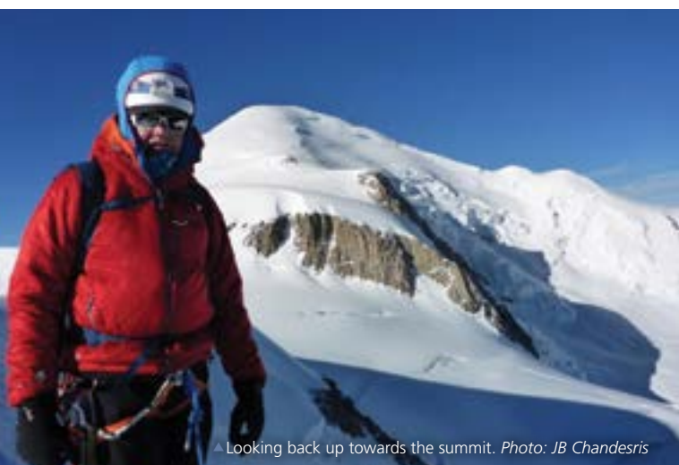
▲ Looking back up towards the summit.