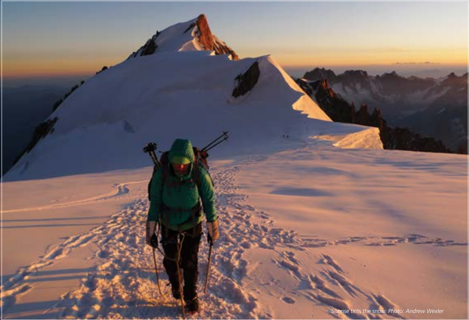
Sunrise tints the snow.