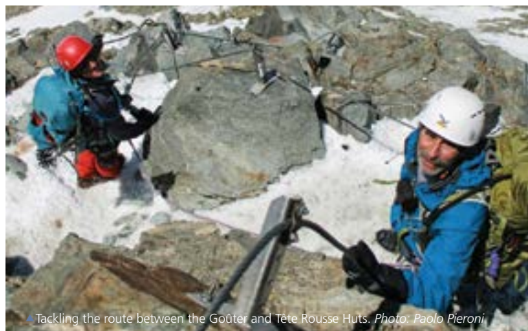
▲ Tackling the route between the Gôûter and Tête Rouse Huts.

Accommodation in the mountains is in alpine huts in shared bunk rooms or dormitory rooms. Blankets are provided and no sleeping bag will be required although you will require a 'sleeping sheet' for personal hygiene under the provided blankets.