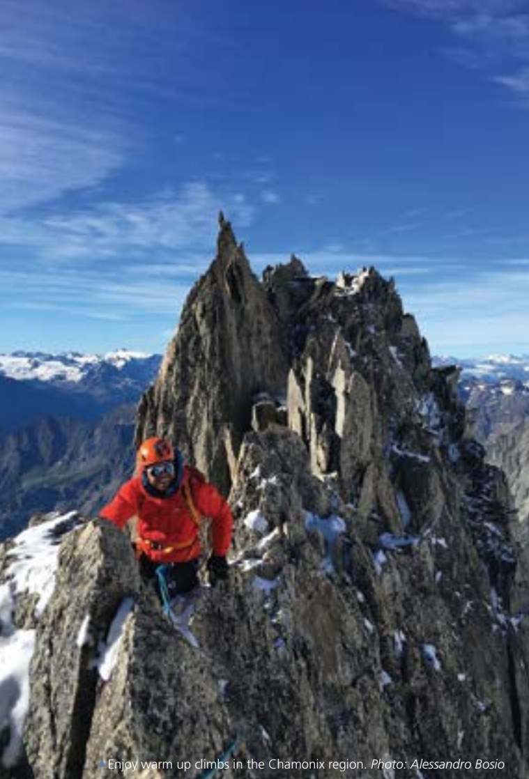
Enjoy warm up climbs in the Chamonix region.

There is no single supplement or private rooms available in the mountain huts but we can arrange this for you in Chamonix. We can also arrange an upgrade to four or five star hotel accommodation—ask about the hotel options if interested.