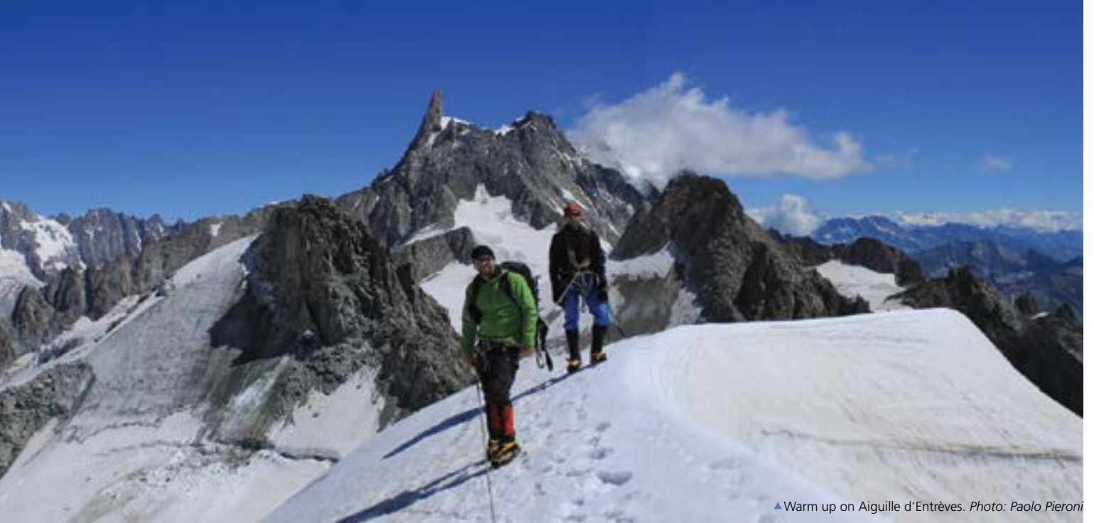
▲ Warm up on Aiguille d'Entrèves.

with a guide) on summit day as a cost-cutting measure. We do not believe this is in your best interest so we adhere to the same guide policy throughout the time you are with us.