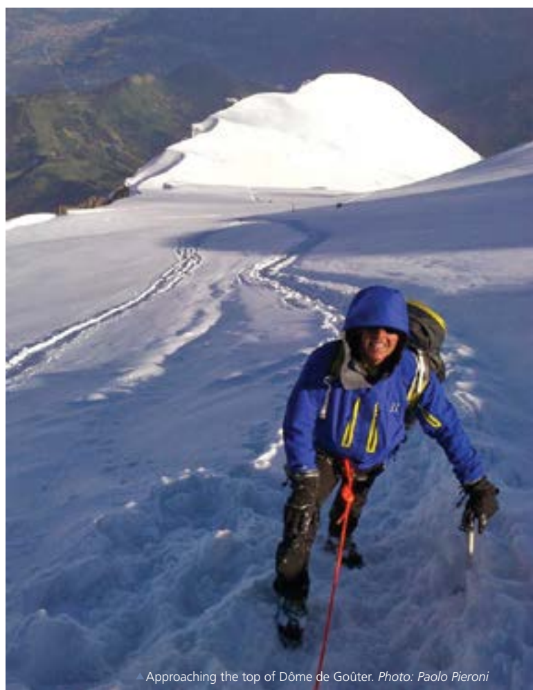
▲ Approaching the top of Dôme de Gôûter.