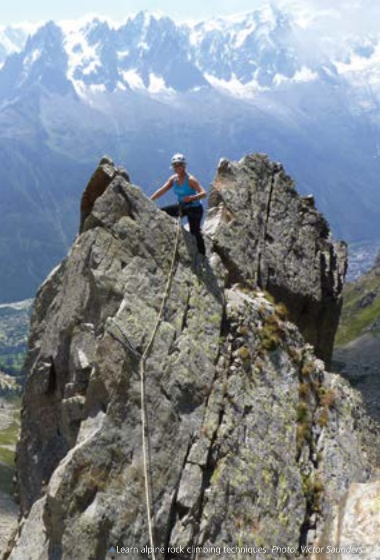
Learn alpine rock climbing techniques.