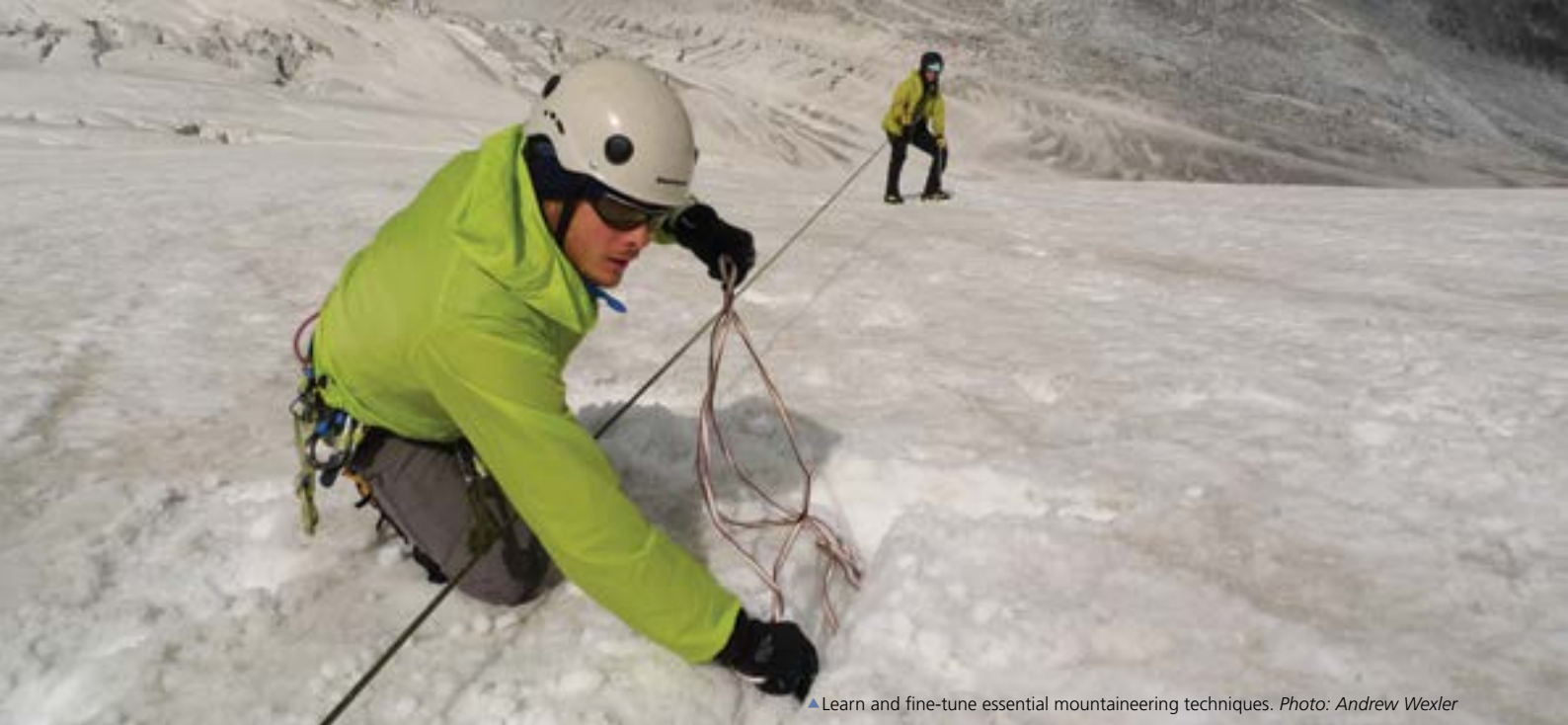
▲ Learn and fine-tune essential mountaineering techniques.