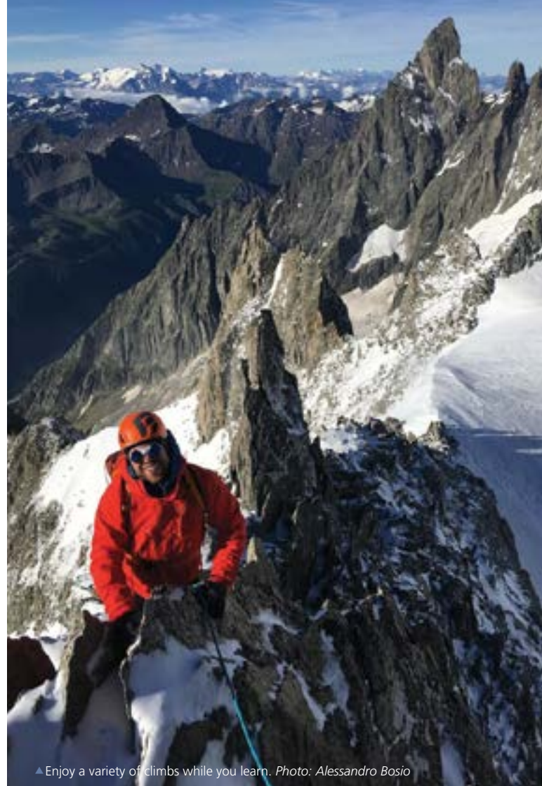
▲ Enjoy a variety of climbs while you learn.