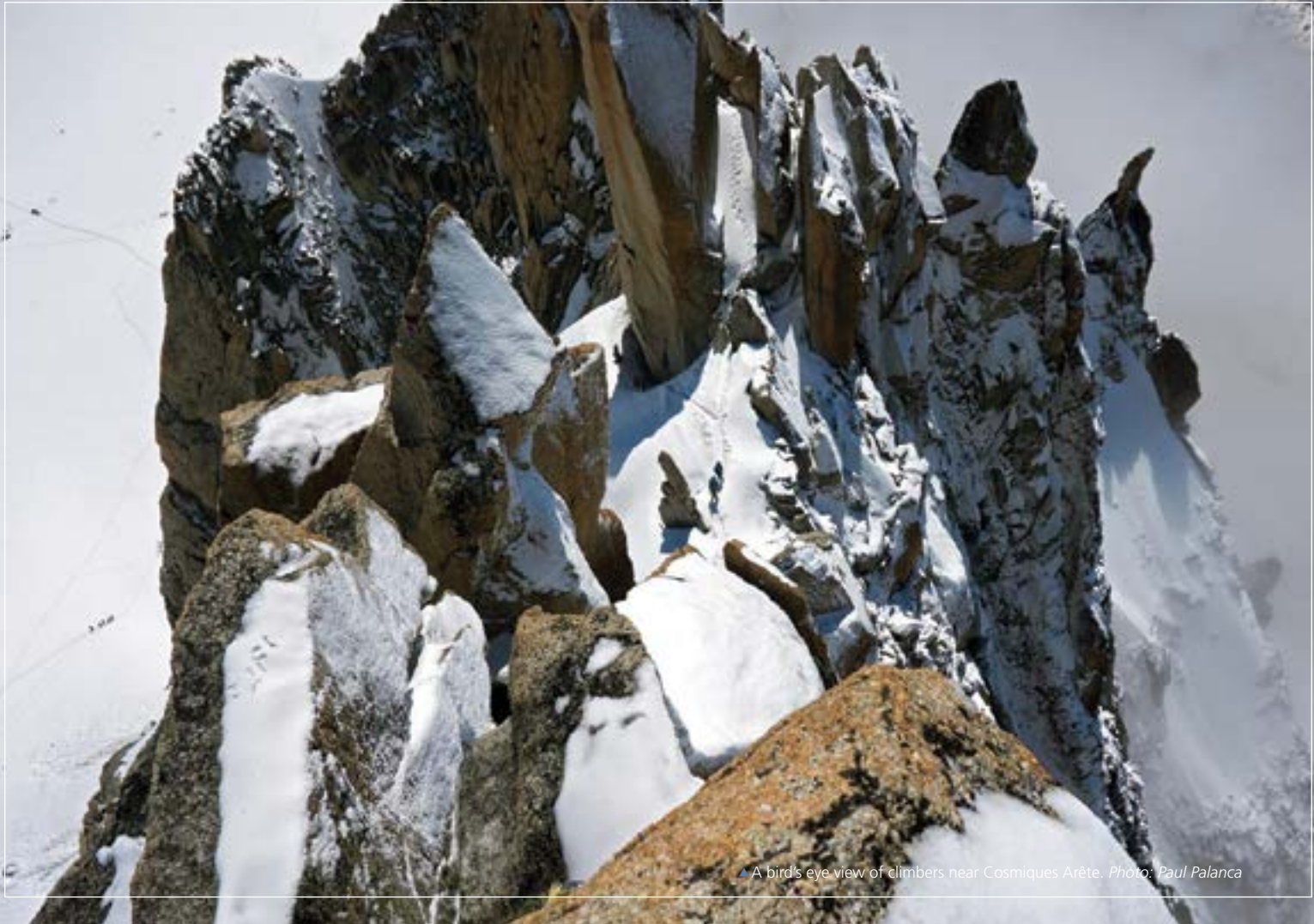
▲ A bird's eye view of climbers near Cosmiques Arête.