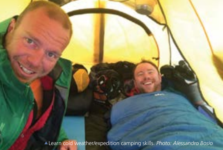
▲ Learn cold weather/expedition camping skills.