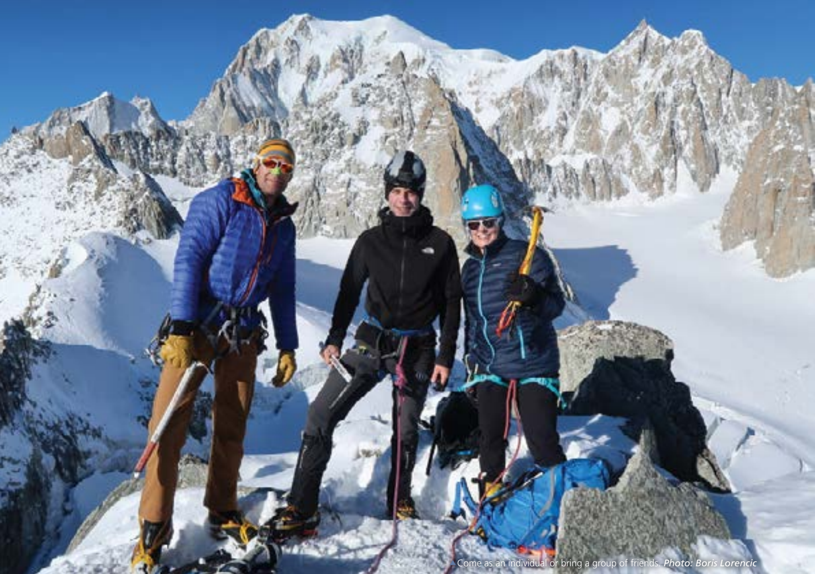
Come as an individual or bring a group of friends.

For the account of Adventure Consultants Limited