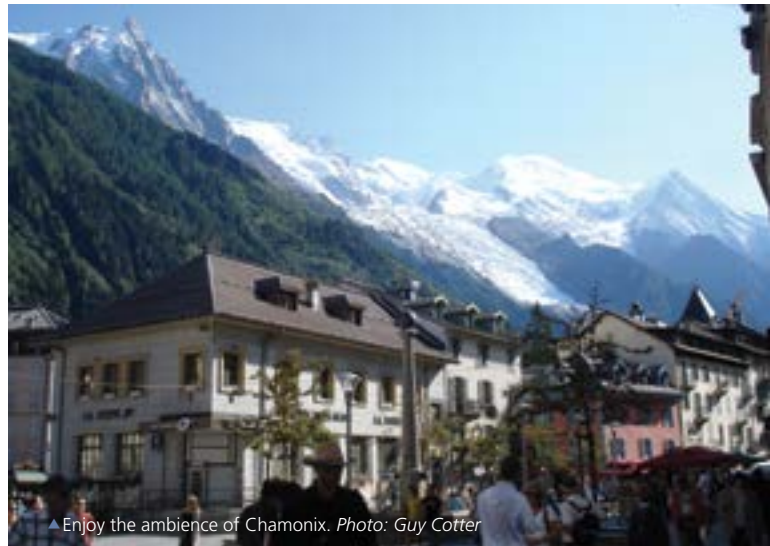
Enjoy the ambience of Chamonix.

Success with the highest margin of care is always a hallmark of our approach, promoting the realisation that even extreme pursuits such as high altitude mountaineering can be undertaken safely.