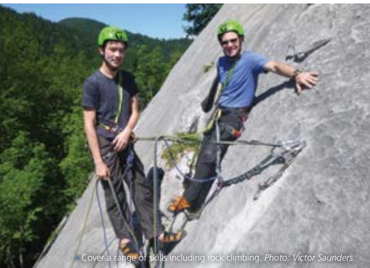
▲ Cover a range of skills including rock climbing.