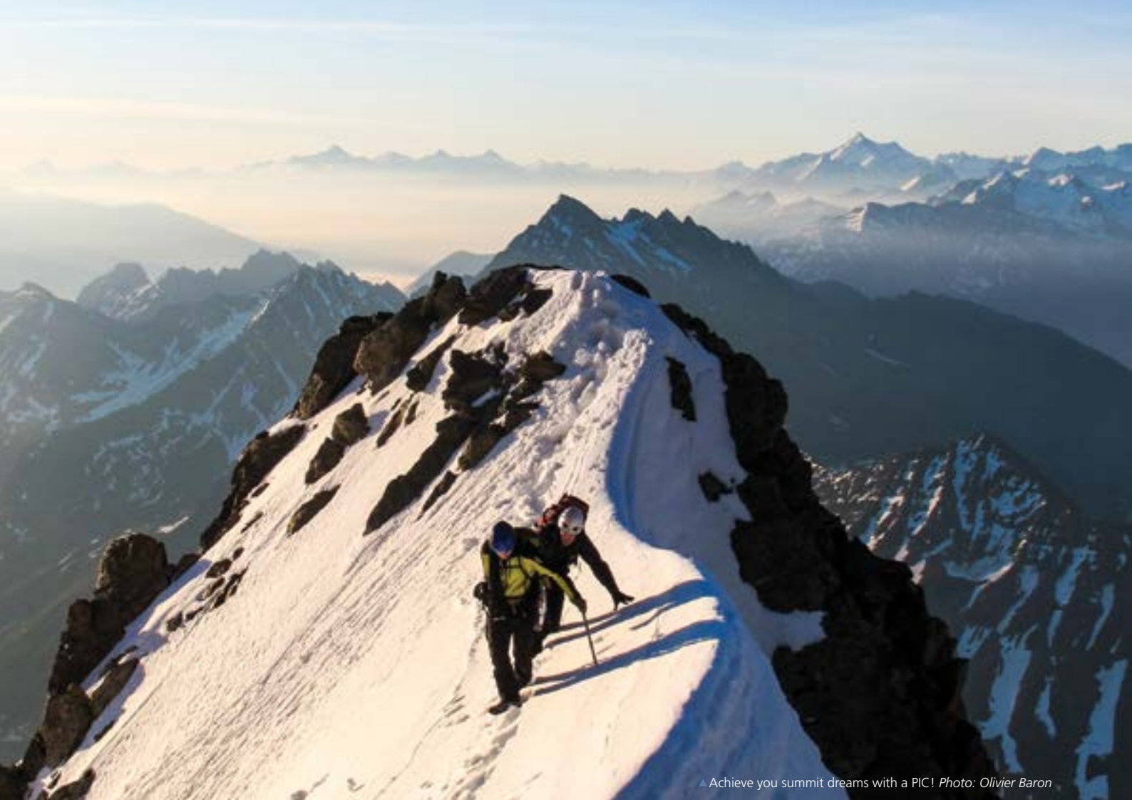
▲ Achieve your summit dreams with a PIC!