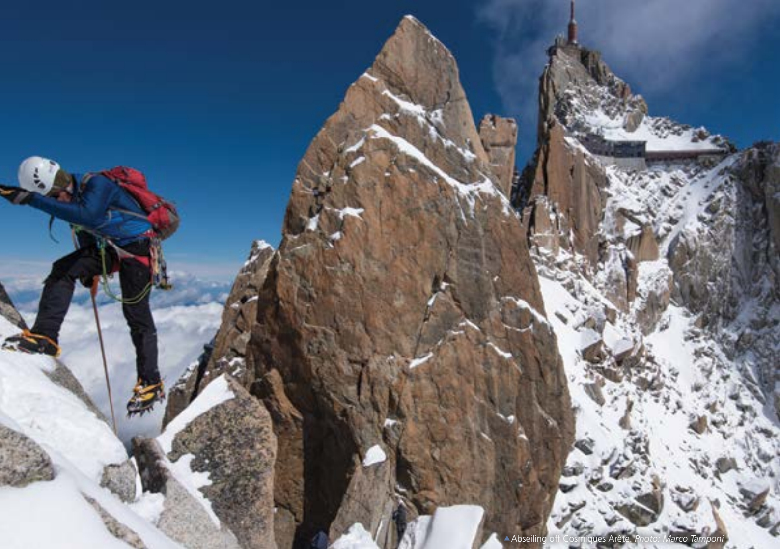
▲ Abseiling off Cosmiques Arête.