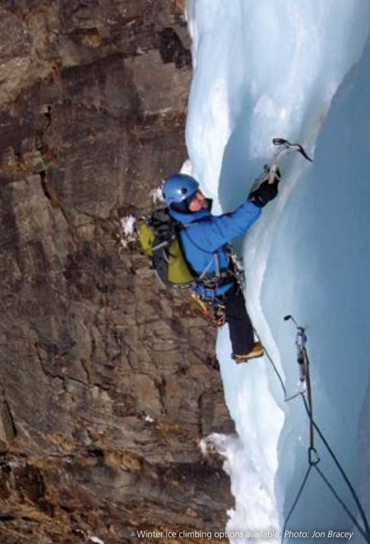
▲ Winter ice climbing options available.

NOTE: All prices are subject to change without notice.