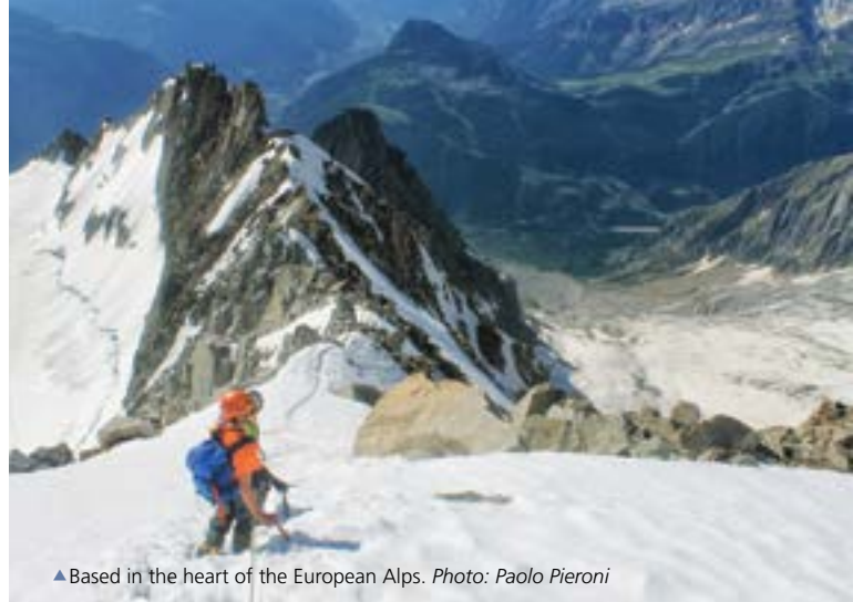
Based in the heart of the European Alps.