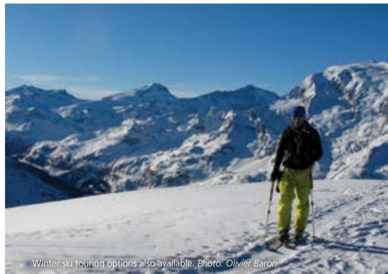
▲ Winter ski touring options also available.

Bank of New Zealand Offshore Branch 42 Willis Street Spark Central Wellington New Zealand