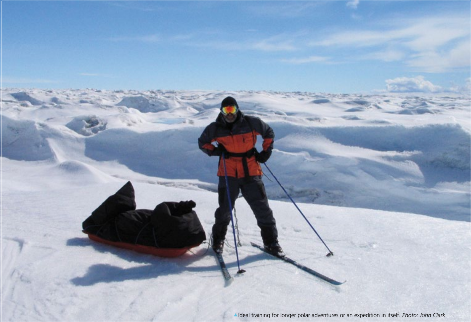
▲ Ideal training for longer polar adventures or an expedition in itself.