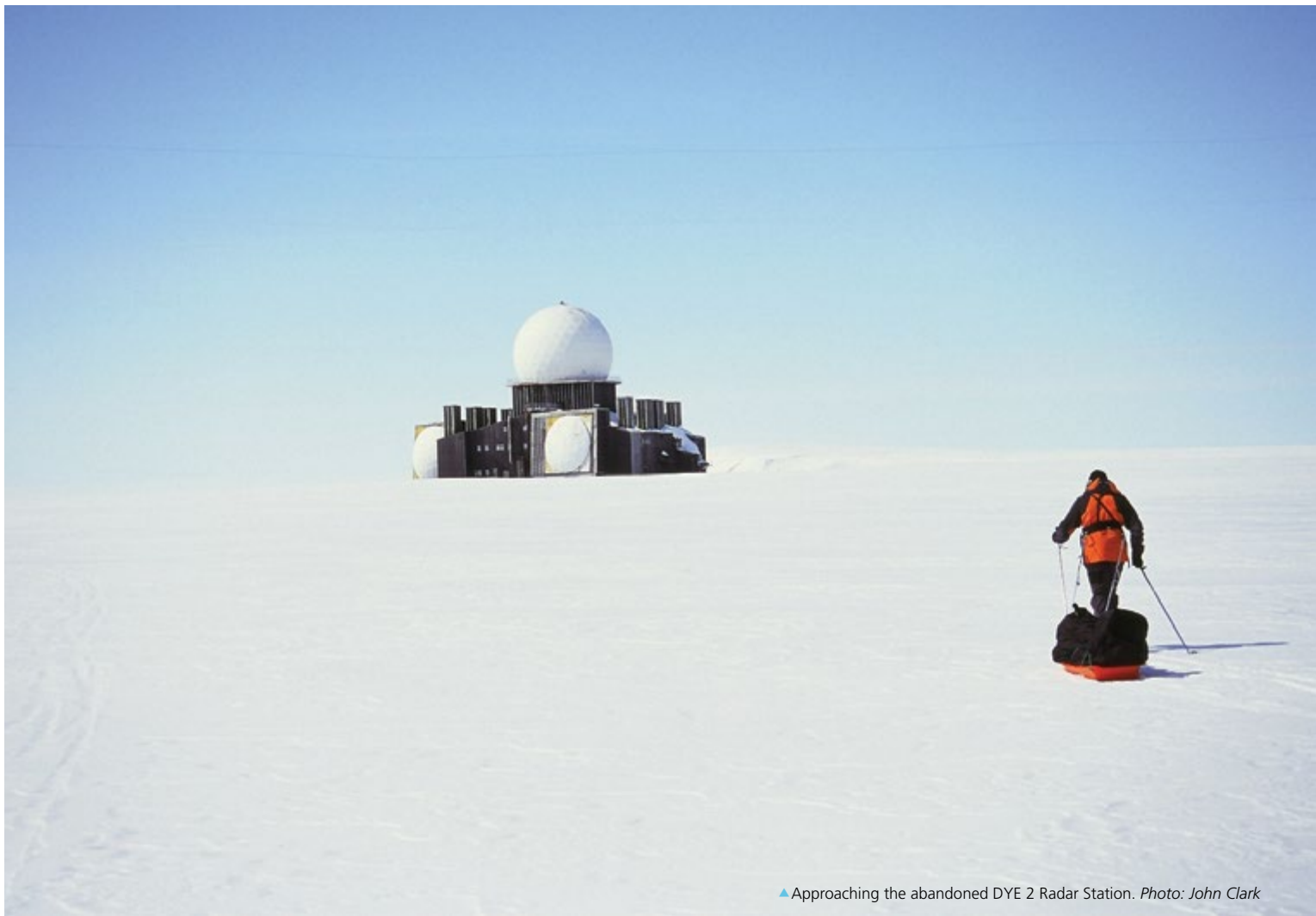
▲ Approaching the abandoned DYE 2 Radar Station.