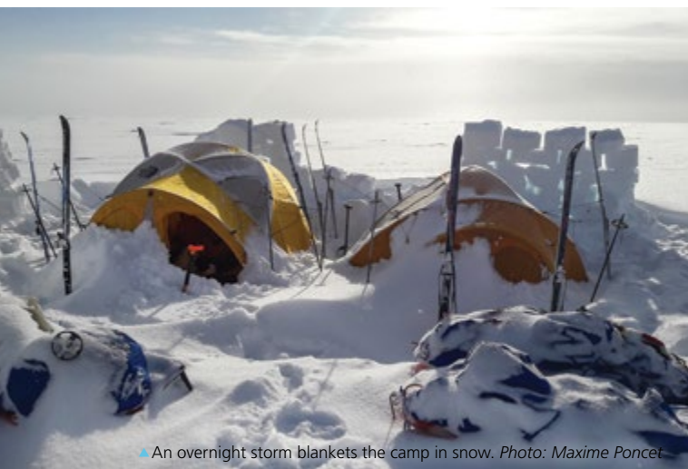
▲ An overnight storm blankets the camp in snow.