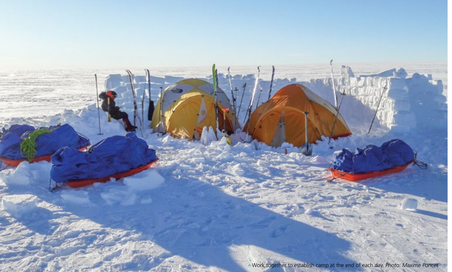
▲ Work together to establish camp at the end of each day.

The expedition will gradually climb to the high point of the ice cap at around 2,500m/8,200ft, before beginning the long descent towards Greenland's west coast.