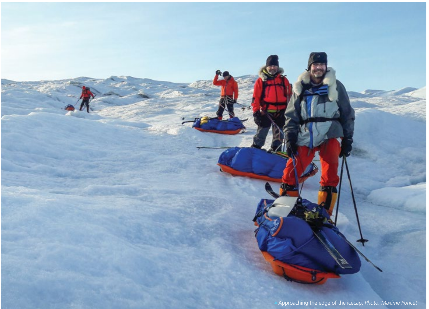
▲ Approaching the edge of the icecap.

We can also accept your deposit and balance payment by credit card (Visa, Mastercard and Amex) plus a 3% card transaction fee.