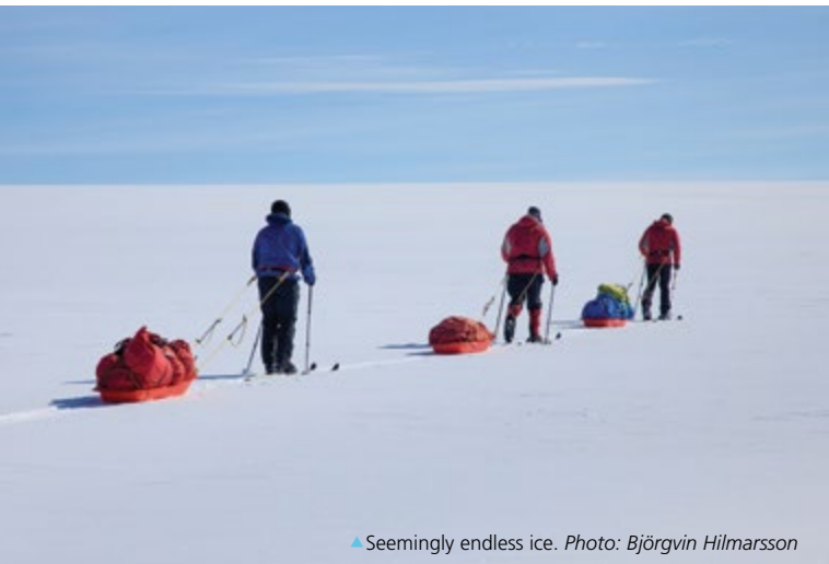
▲ Seemingly endless ice.

Adventure Consultants will supply all group gear (e.g. tents, stoves, food and sleds), whilst expedition members are to provide their own personal clothing and equipment including skis, skins and boots.