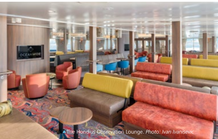
▲ The Hondius Observation Lounge.