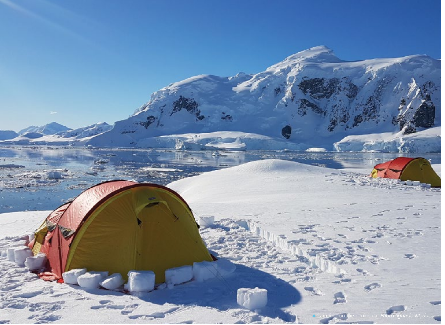
▲ Camping on the peninsula.