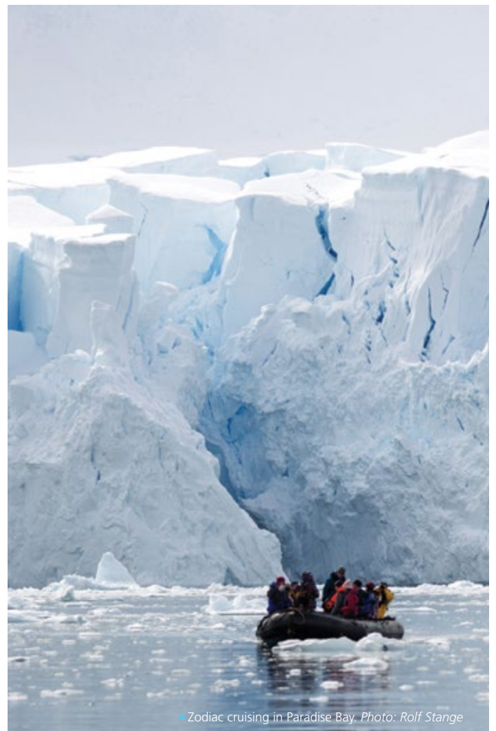
▲ Zodiac cruising in Paradise Bay.