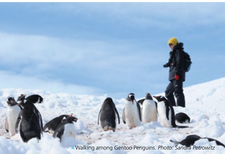
▲ Walking among Gentoo Penguins.

On your last day of near-shore activities, you pass the Melchior Islands toward the open sea. Keep a sharp lookout for humpback whales in Dallmann Bay. You might also shoot for Half Moon Island, in the South Shetlands, with further chances for activities. Conditions on the Drake Passage determine the exact time of departure.