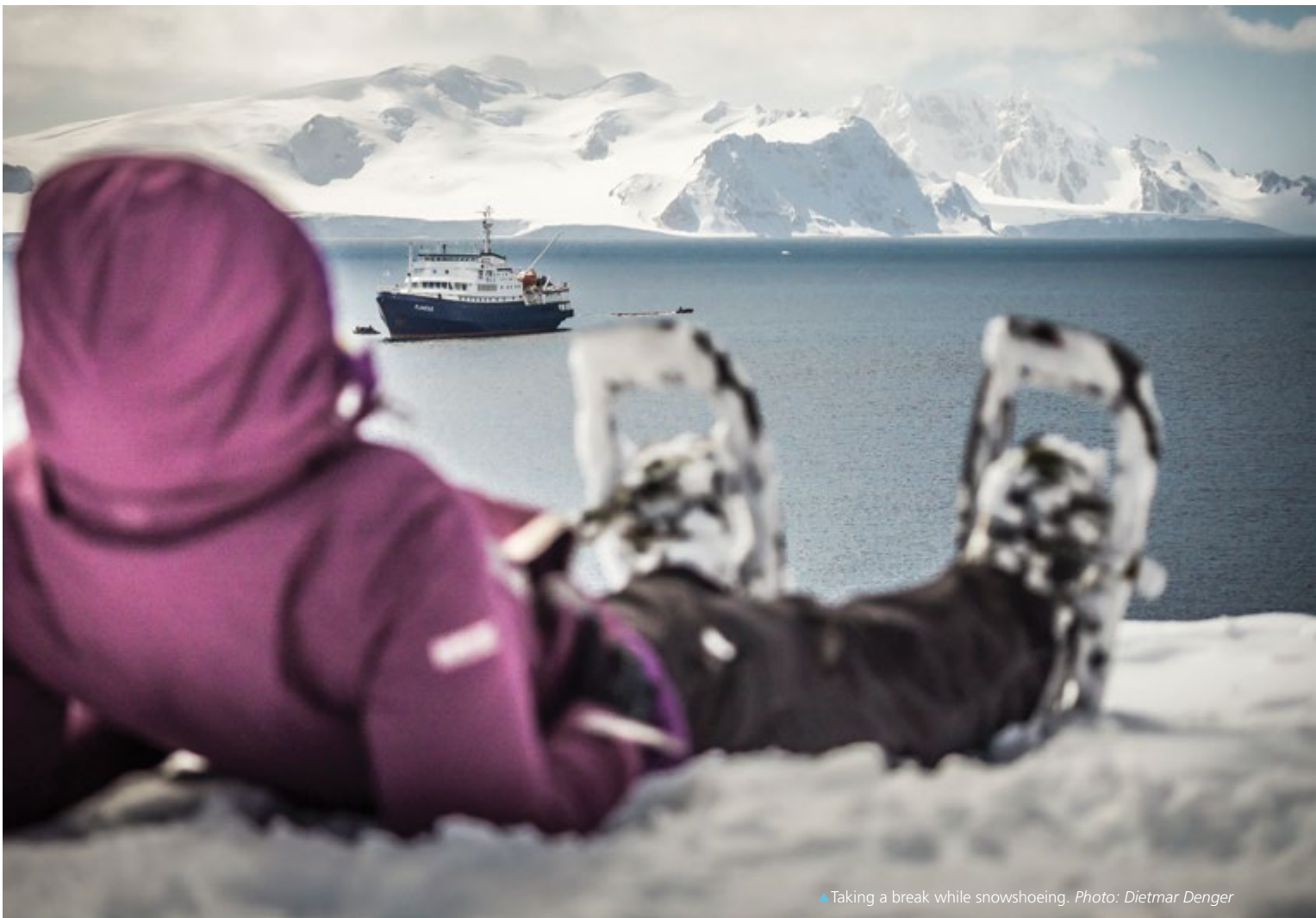
▲ Taking a break while snowshoeing.