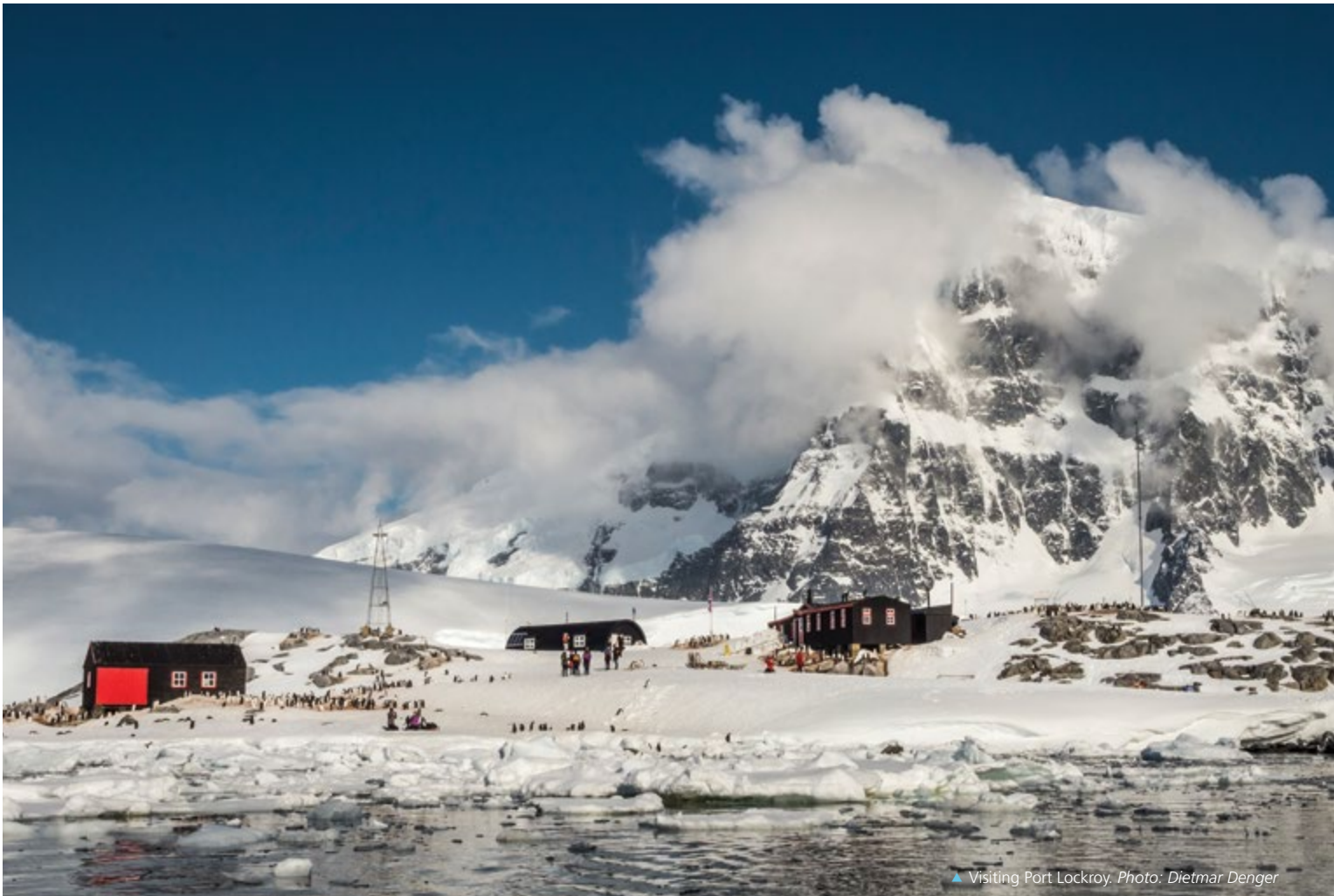
▲ Visiting Port Lockroy.