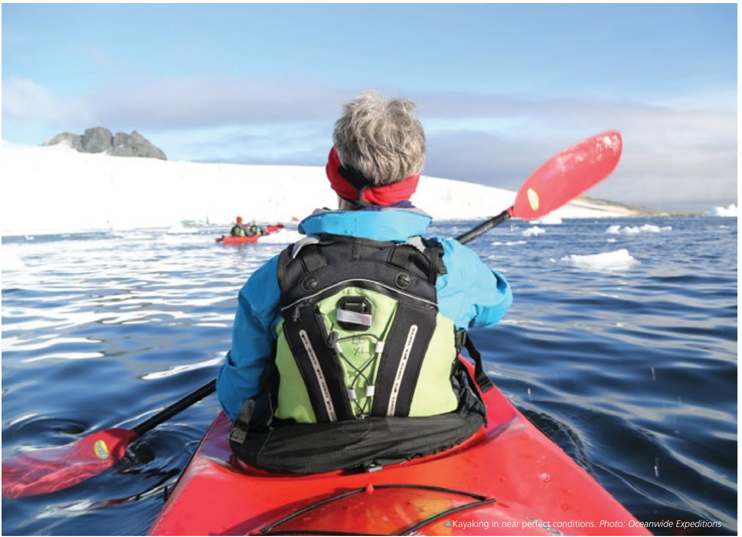
▲ Kayaking in near perfect conditions.