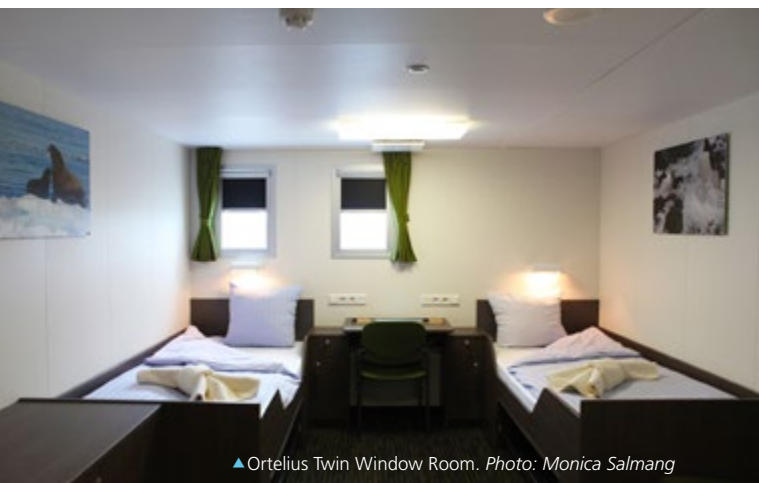
▲ Ortelius Twin Window Room.

Trip 4: December 29, 2024 to January 10, 2025 (High Season) Trip 5: January 10–22, 2024 (High Season)