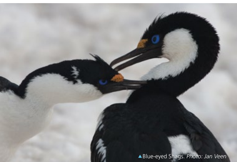
▲ Blue-eyed Shags.