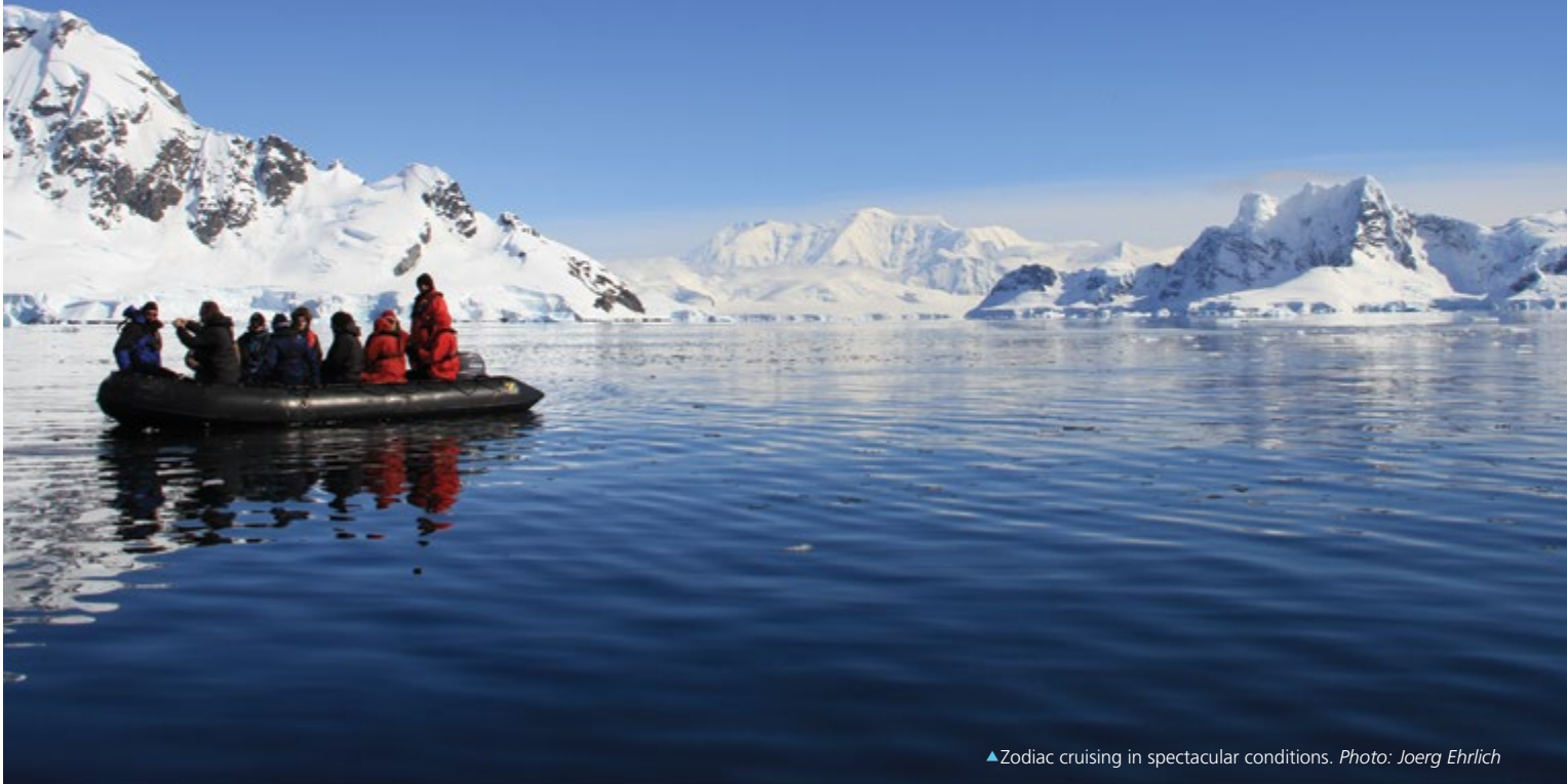
▲Zodiac cruising in spectacular conditions.