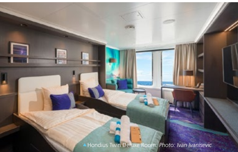
▲ Hondius Twin Deluxe Room.

M/V Hondius is the world's first-registered Polar Class 6 passenger vessel, making her among the most structurally fortified and technologically advanced polar cruise ships on the seas. The Hondius is the more luxurious of the three ships. It was built in 2019 and accommodates 170 passengers, with additional berth options of a Junior or Grand Balcony Suite.