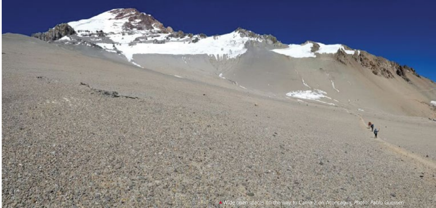
▲ Wide open spaces on the way to Camp 2 on Aconcagua.

For those wishing to attempt the Polish Glacier, a higher base skill is required. Please contact us to see if you have the appropriate experience. The route requires technical snow/ice climbing above 6,000m/19,500ft.