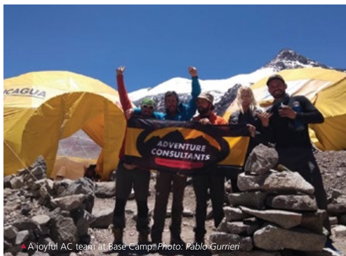
▲ A joyful AC team at Base Camp.