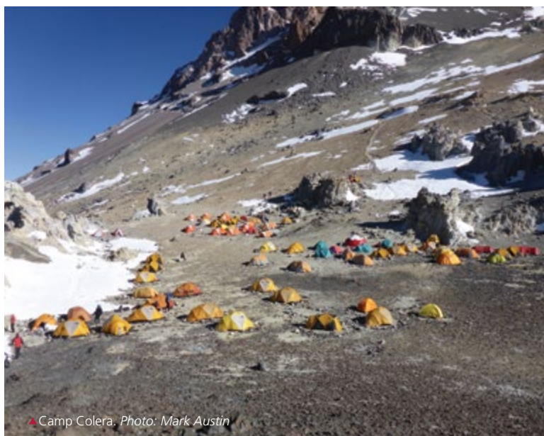
▲ Camp Colera.

The team will have a maximum size of 12 members and 3 guides. You will find the Adventure Consultants mountain guides strong and companionable Expedition Leaders with the capacity and willingness to see you achieve your goals. The number of guides is determined by the team size but the normal ratio of guides to members is 1:4 for the Vacas Valley route.