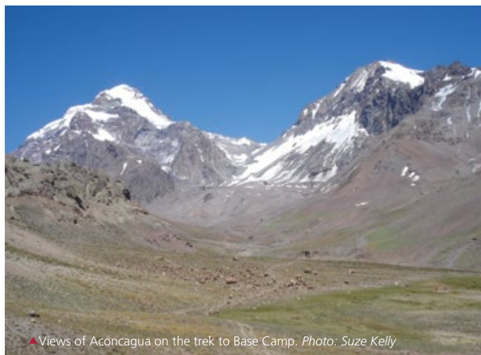
▲ Views of Aconcagua on the trek to Base Camp.