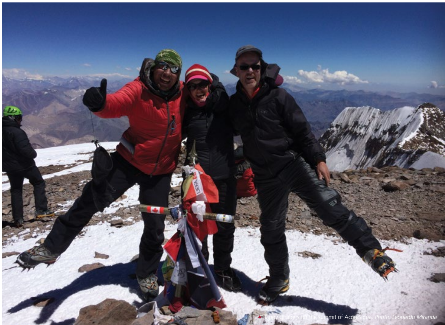
▲ Happy climbers on the summit of Aconcagua.

To maximise safety and summit opportunities our schedule allows several contingency days. We operate with small groups to ensure individualised attention and further enhance our efficiency and safety. We place special emphasis on ensuring the highest standards in accommodation, transport, food, equipment and guiding expertise.