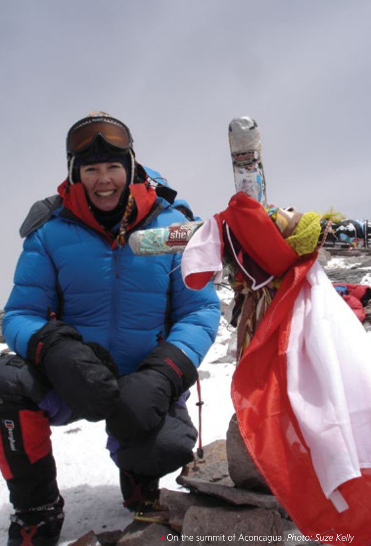
On the summit of Aconcagua.