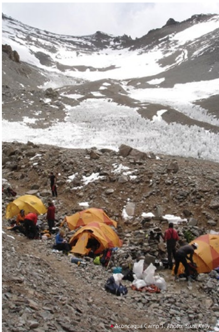
▲ Aconcagua Camp 1.