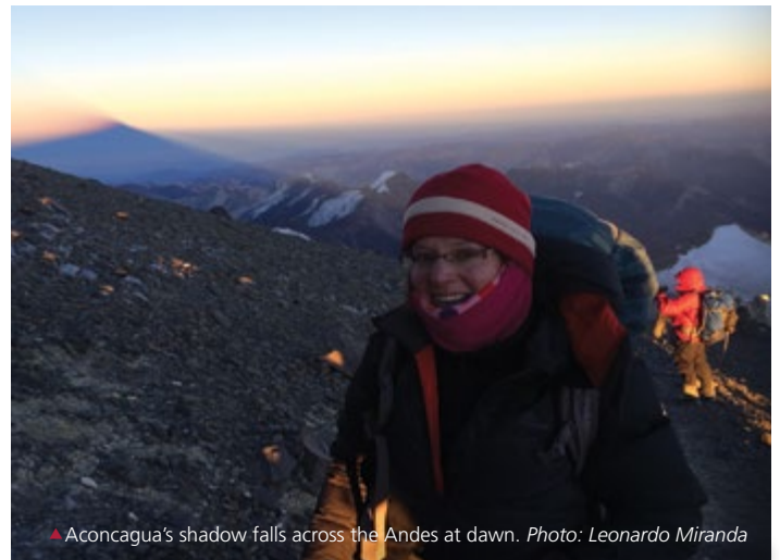
▲ Aconcagua's shadow falls across the Andes at dawn.