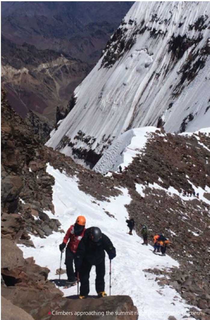
▲ Climbers approaching the summit ridge.