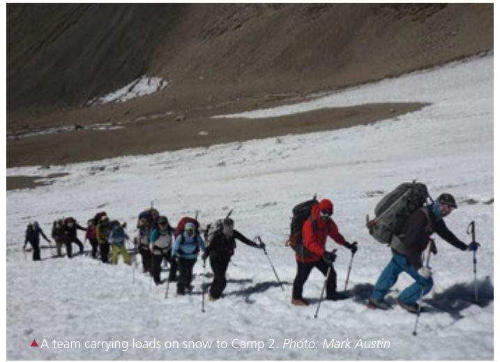
▲ A team carrying loads on snow to Camp 2.