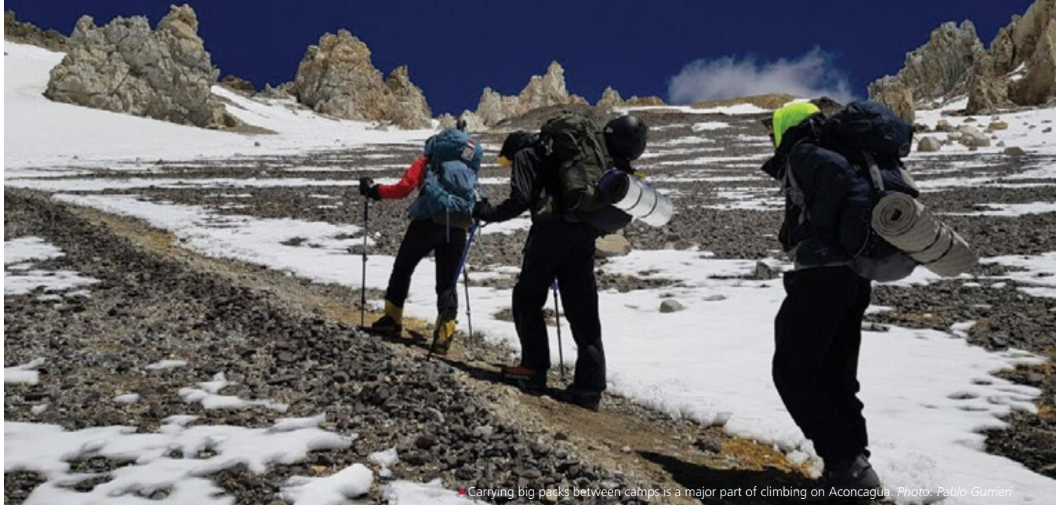
Carrying big packs between camps is a major part of climbing on Aconcagua.