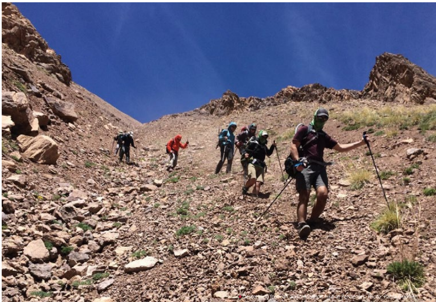
Descending from an acclimatisation hike at Penitentes.

Upon arriving at Plaza Argentina Base Camp, our sleeping tents will be established in rock windbreaks on the moraine of the Relinchos Glacier. We utilise a large heated and insulated dining tent, complete with sturdy flooring, and have excellent catered meals whilst at Base Camp. After dinner, we can relax in the comfortable lounge area to read or socialise with other members. There is power for charging devices, Wi-Fi and hot showers available free of charge. A valuable acclimatisation and organisation day will occur before we begin carrying and caching equipment to Camp 1 (4,700m/15,400ft) the following morning. We continue to ascend in a lightweight expedition style progressively establishing three camps over a 7 to 10-day period. Camps on the mountain are as comfortable as the conditions allow; we have a dining tent at Camp 1 and Camp 2 where meals of 'real' (not dried) food are prepared by your guides, and at Camp 3 there is a large cook tent staffed by a dedicated guide who assists in preparing food and drinks and provides additional support to the group.