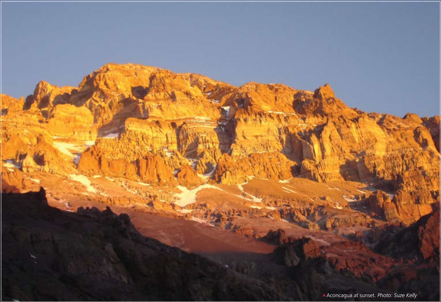
▲ Aconcagua at sunset.