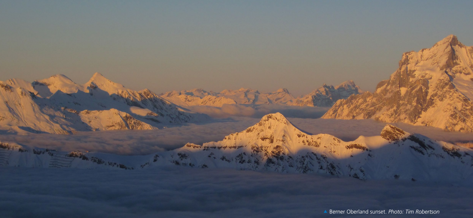
▲ Berner Oberland sunset.

Adventure Consultants only employs IFMGA qualified guides for European ascents and courses. Guides must undergo rigorous training and assessment on climbing skills, instructional skills, avalanche training and assessment, wilderness first aid, rescue training and much more to gain these qualifications. It takes many years to attain IFMGA status, which ensures you are getting a world-class professional service.