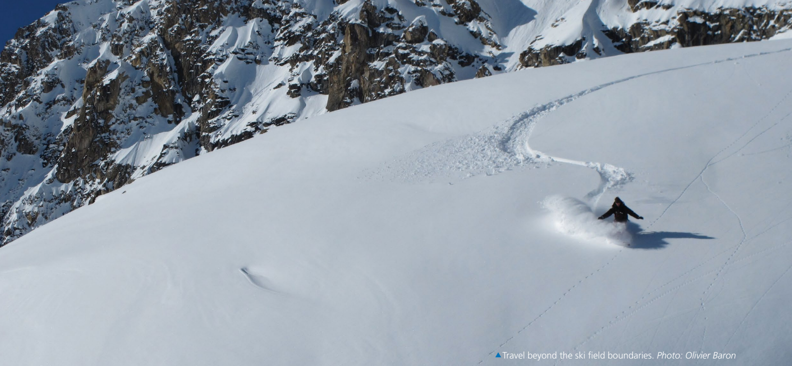
▲ Travel beyond the ski field boundaries.

upon confirmation of your booking. A selection of rental equipment is available in Grindelwald should you need to hire any equipment.