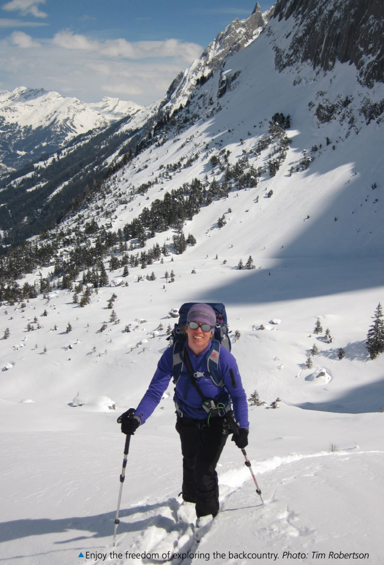
▲ Enjoy the freedom of exploring the backcountry.