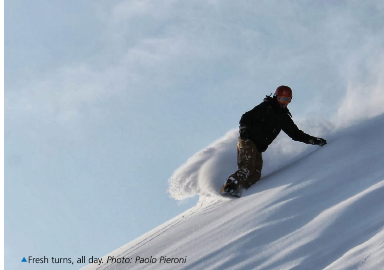
▲ Fresh turns, all day.