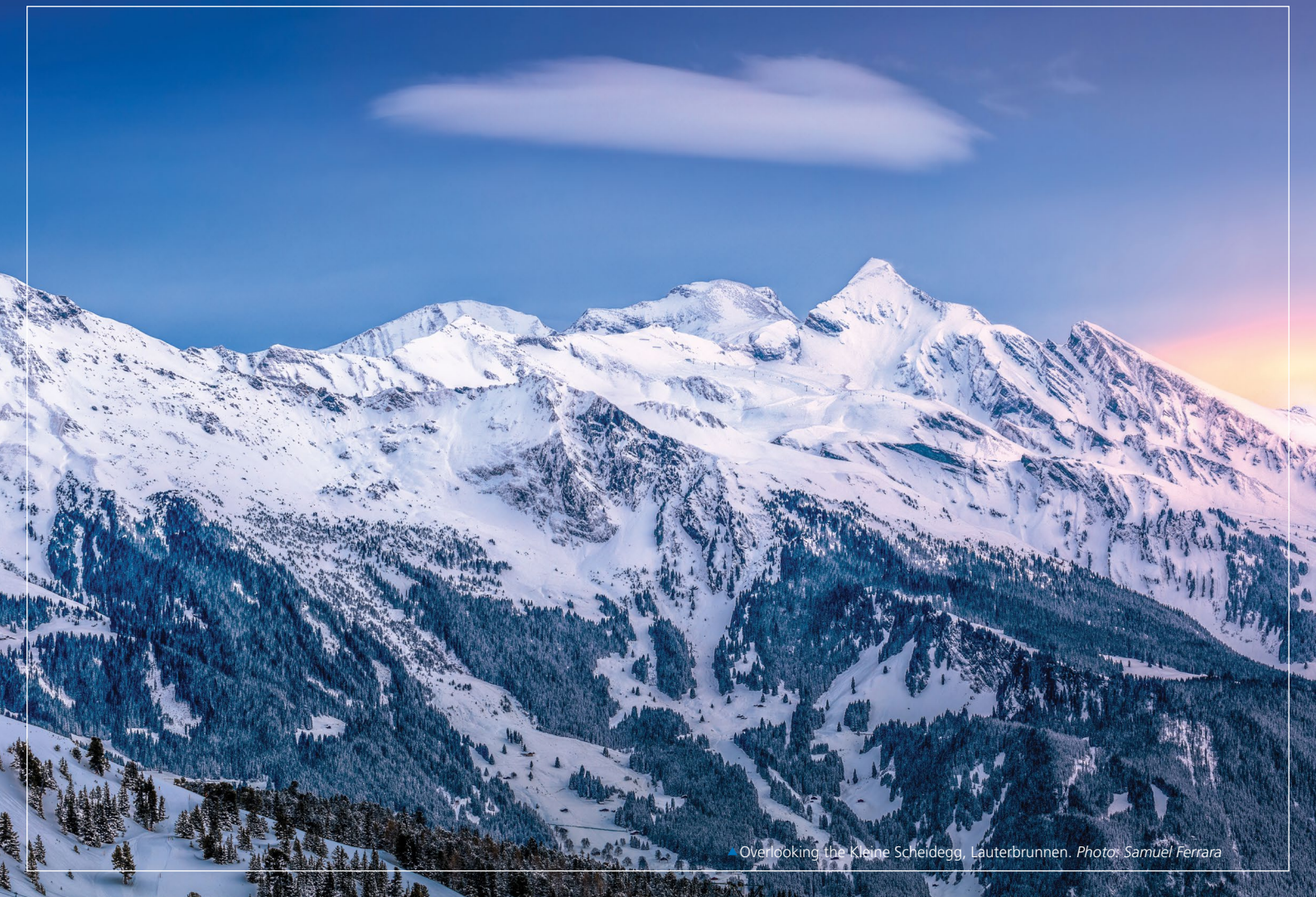
▲ Overlooking the Kleine Scheidegg, Lauterbrunnen.