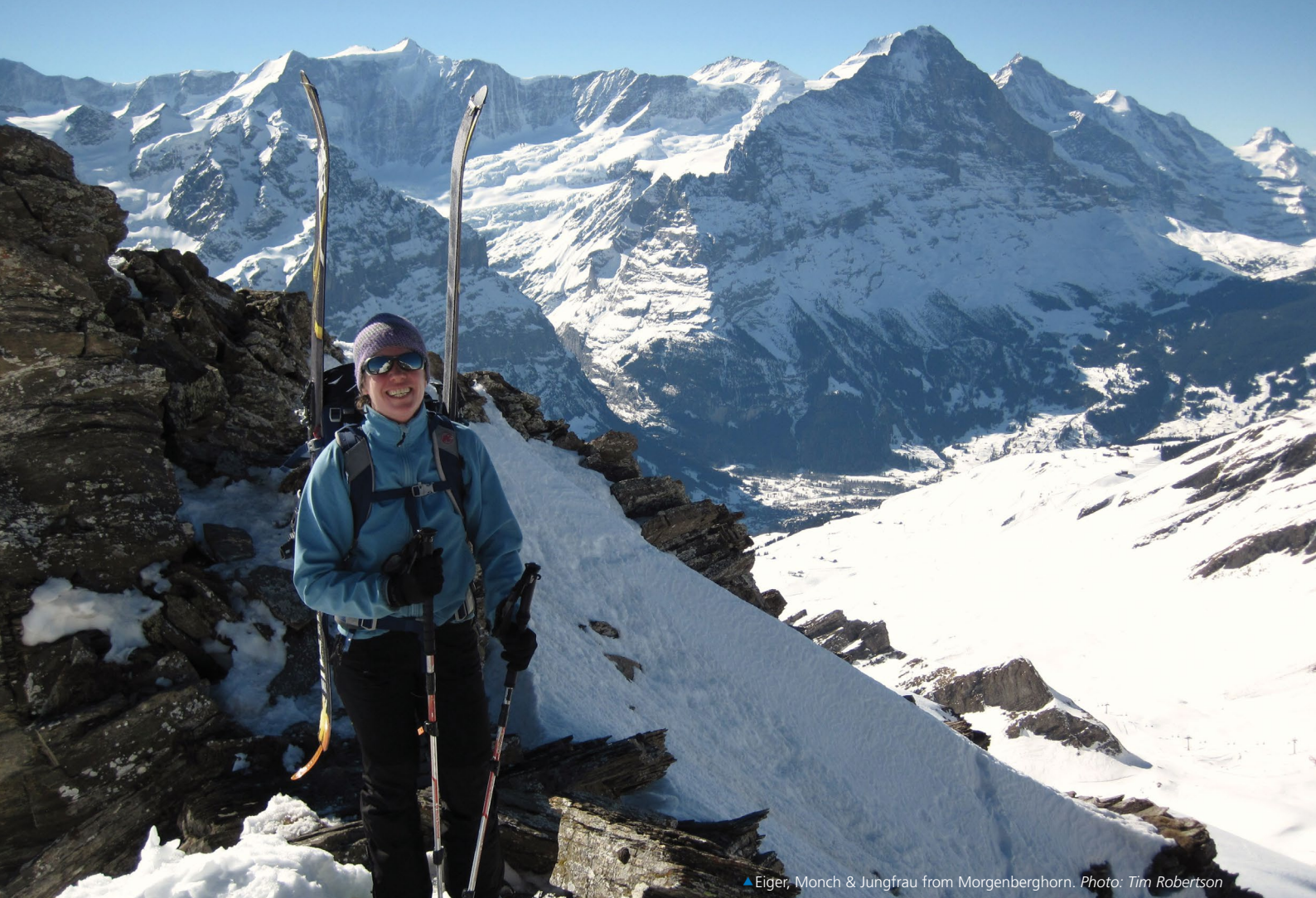
▲ Eiger, Monch & Jungfrau from Morgenberghorn.