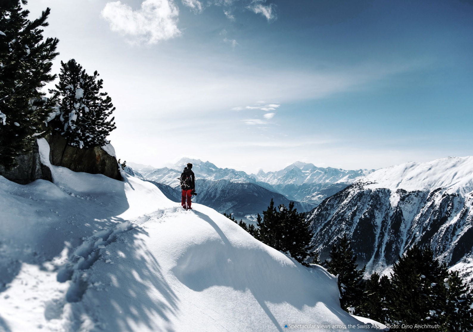
▲ Spectacular views across the Swiss Alps.

€6,100 for 1:1 guide to skier ratio €3,770 per person 1:2 guide to skier ratio €3,090 per person for 1:3 guide to skier ratio €2,680 per person for 1:4 guide to skier ratio